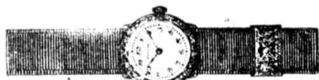
Waltham "Lady Waltham" No. 15 Hand Case of Pure Green Gold