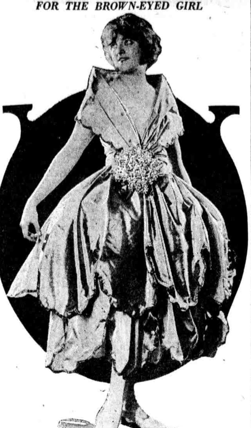
A crisp frock of yellow taffeta makes a charming costume for the winter dance. The scalloped edges, bound with "more of the same," make all the necessary trimming and a round bouquet of violets at the waist gives the contrast that every gown needs for relief and variation. The high horse-collar above the decolletage is interesting and becoming

Most of the new frocks have some sort of metal girdle. Here is a RINGED GIRDLE for your new frock. Use brass or other metal rings of any size you like. With silk for small rings, or worsted for large ones, crochet four small patches of buttonhole stitches on each ring. Then stitch the rings together to form the girdle. Or you can crochet the two rings together at one time. Join two long ends with a tassel of the silk or worsted at each end. Have your RINGED GIRDLE close at one side with a hook and eye. Use silk or worsted of a color that will give a bright touch to the frock. What a man has done doesn't count alongside of what he is doing; like the he must lay a fresh egg every day. Cakrathia from Woodrow Wilson: