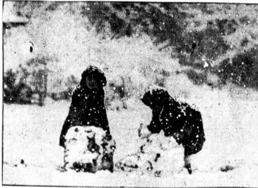
PACKING SNOW. The boys were busy rolling big ones when snapped in Washington Square at noon yesterday.