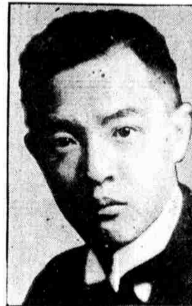
ZIANG-LING CHANG, secretary of Chinese delegation at Arms Conference.