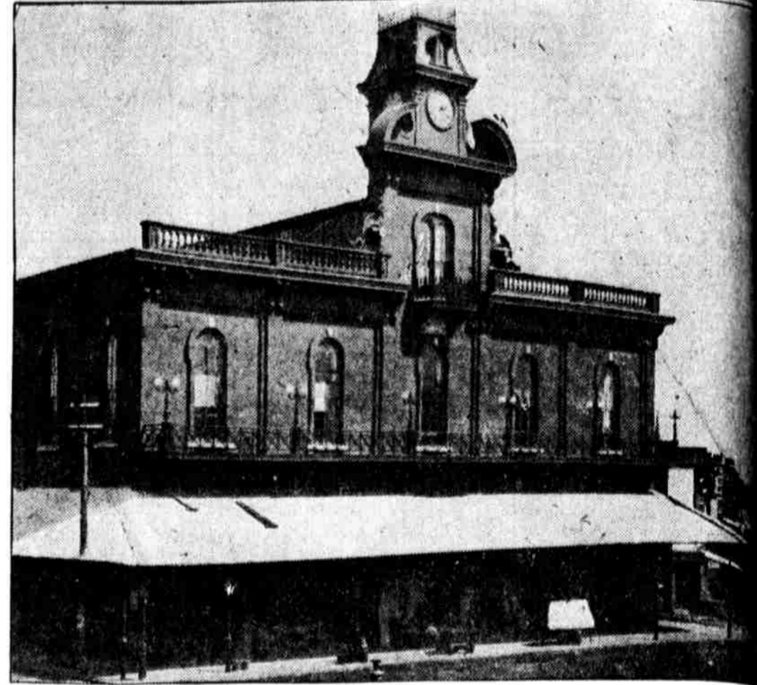
DID YOU EVER DO YOUR WEEK-END SHOPPING IN THIS BUILDING? The photo shows the Lincoln Market House, at Broad street and Fairmount avenue, as it looked before Broad street was paved and when a horse-car line was operated on Fairmount avenue. The site is now occupied by the Lorraine Hotel. Have you a picture of old Philadelphia? Send it to the EVENING PUBLIC LEDGER.