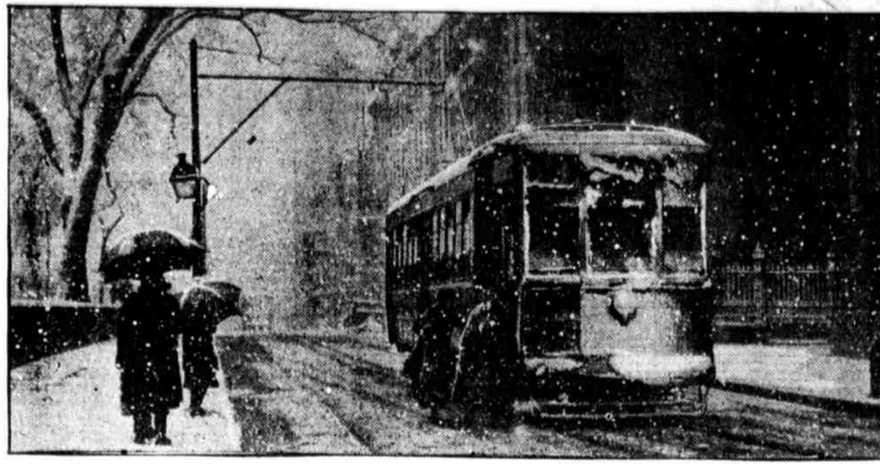
AT SIXTH AND WALNUT STREETS. Comparatively few persons left their homes to face the blinding snow. The trolley system was not seriously inconvenienced.