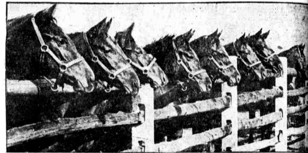
THE "WINNERS" OF THE FUTURE. Yearling colts, which will soon carry the colors of the George D. Widener stables, are now wintering at Elkins Park. There seemed to be no era shyness among the youngsters.