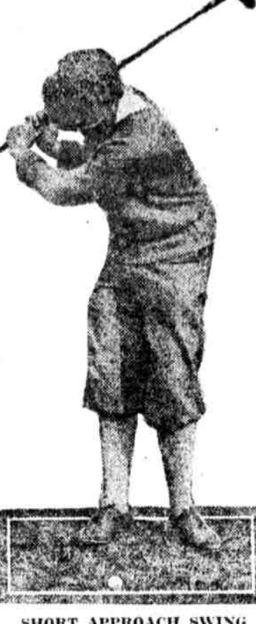
SHORT APPROACH SWING

We suggest GIRARD Americas Foremost Cigar Autunio Holg & Langsdorf