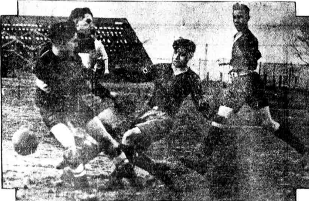
KICKERS AT WORK. On the Central High field, Twenty-ninth and Somerset streets, yesterday, the Central boys played soccer against the cadets of the Schoolship Annapolis. The two players at the right are Central boys.