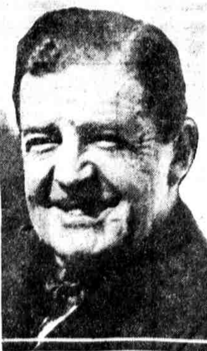
SAILS FOR HOME. Admiral Beatty, British Navy, aboard Adriatic, going to England.