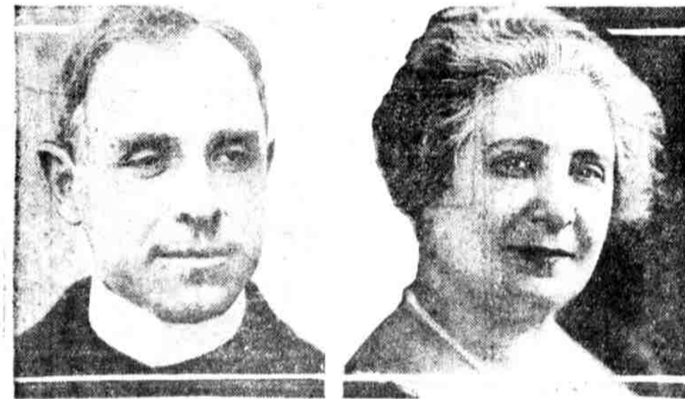
BISHOP CHAS. WESLEY BURNS of Mortana at conference here. MADAME VIVIANI. Latest photograph of the wife of the former French Prime Minister, now in Washington.