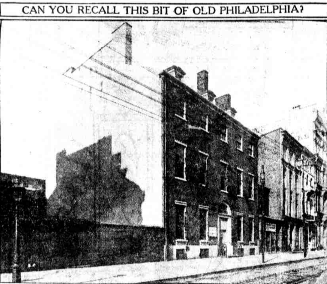
CAN YOU RECALL THIS BIT OF OLD PHILADELPHIA?