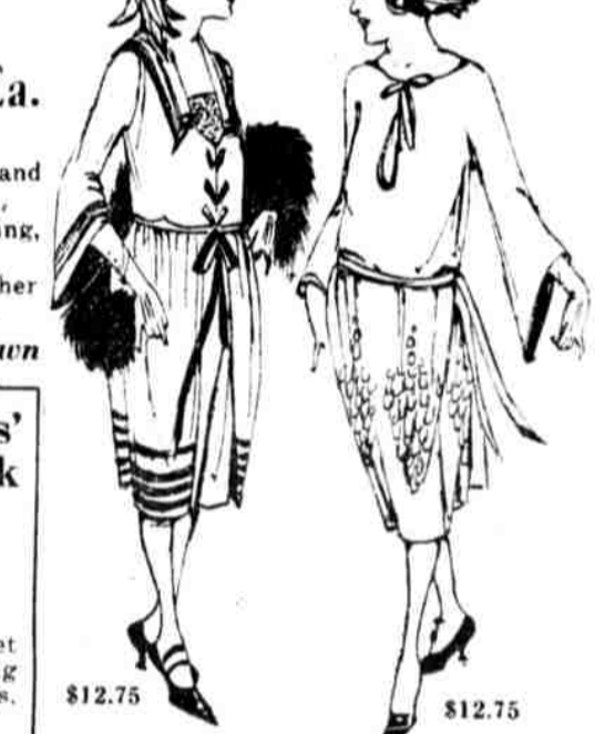
SNELLENBURGS Second Floor

A Big Factory Clearance of Men's & Boys' $7.50 and $8.50 Heavy Shaker-Knit Sweaters