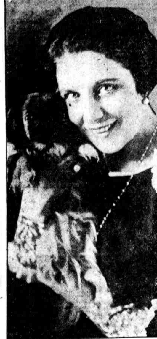
GERALDINE FARRAR, the famous grand opera star, whose divorce action against Lou Tellegen, is now pending.