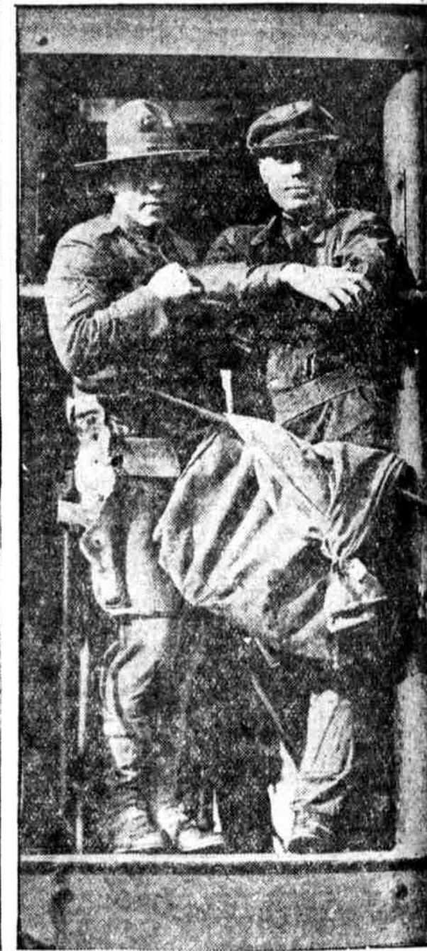
BOTH READY FOR BUSINESS. At the door of a mail car on a Philadelphia and Reading Railway train. Both marine and clerk keep a close watch.