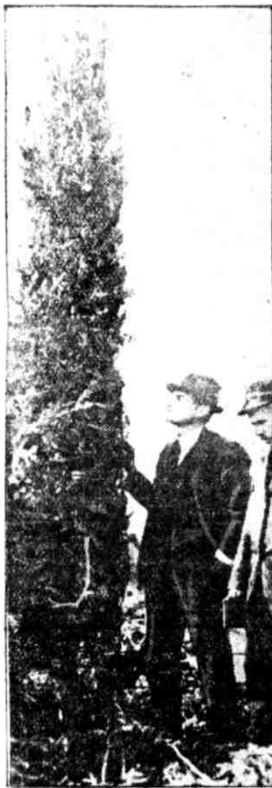
PROSPECTIVE BUYER. He was one of the first to seek a Christmas tree at 19th & Indiana.