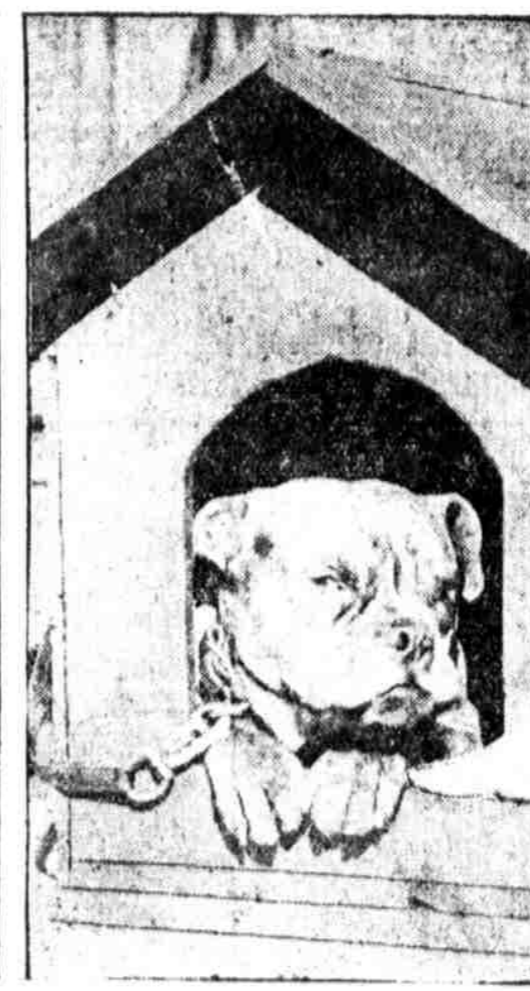
NOT AT A DOG SHOW. Just a little anti-burglary equipment that has been added by a Philadelphian who lives at 22d and Spruce.