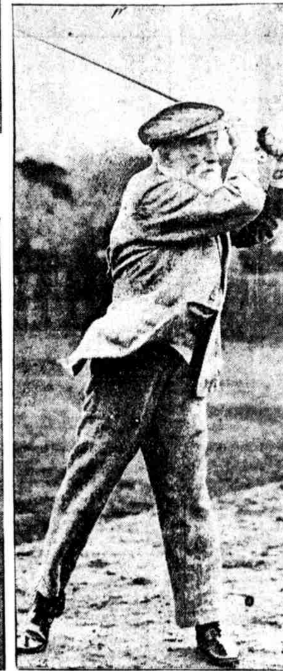
NINETY-THREE. That's not the score. It's the age of Deputy Surgeon General Clarence Cooper, of England.