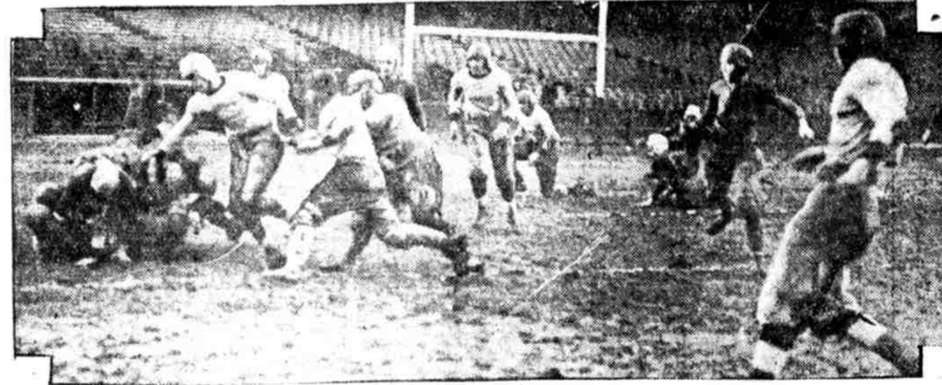
CHICAGO SCHOOLBOYS WIN. The La Grange High School team came from the Western city to cross La Salle Prep's line, the first time it has been done this year. The visitors won, 7 to 6.