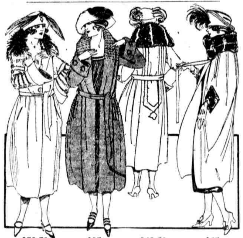
$58.50 $25 $42.50 $65

For business, shopping and afternoon wear there are many, many frocks of serge, velour, jersey and tricotine, showing interesting style variety. Among them are navy, brown, reindeer and henna.