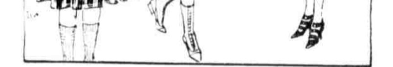
$3 $10.75 $23.50

Good leather belts to wear them with are in brown, tan or black at 50c to $1.50. (Gallery, Market)