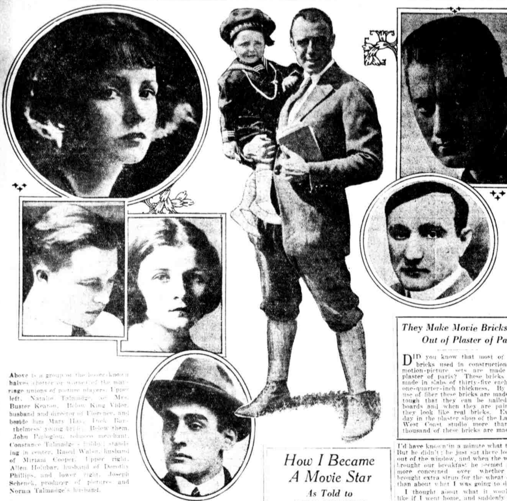
They Make Movie Bricks Out of Plaster of Paris

WHO SAYS FILM STARS CAN'T MARRY HAPPILY?