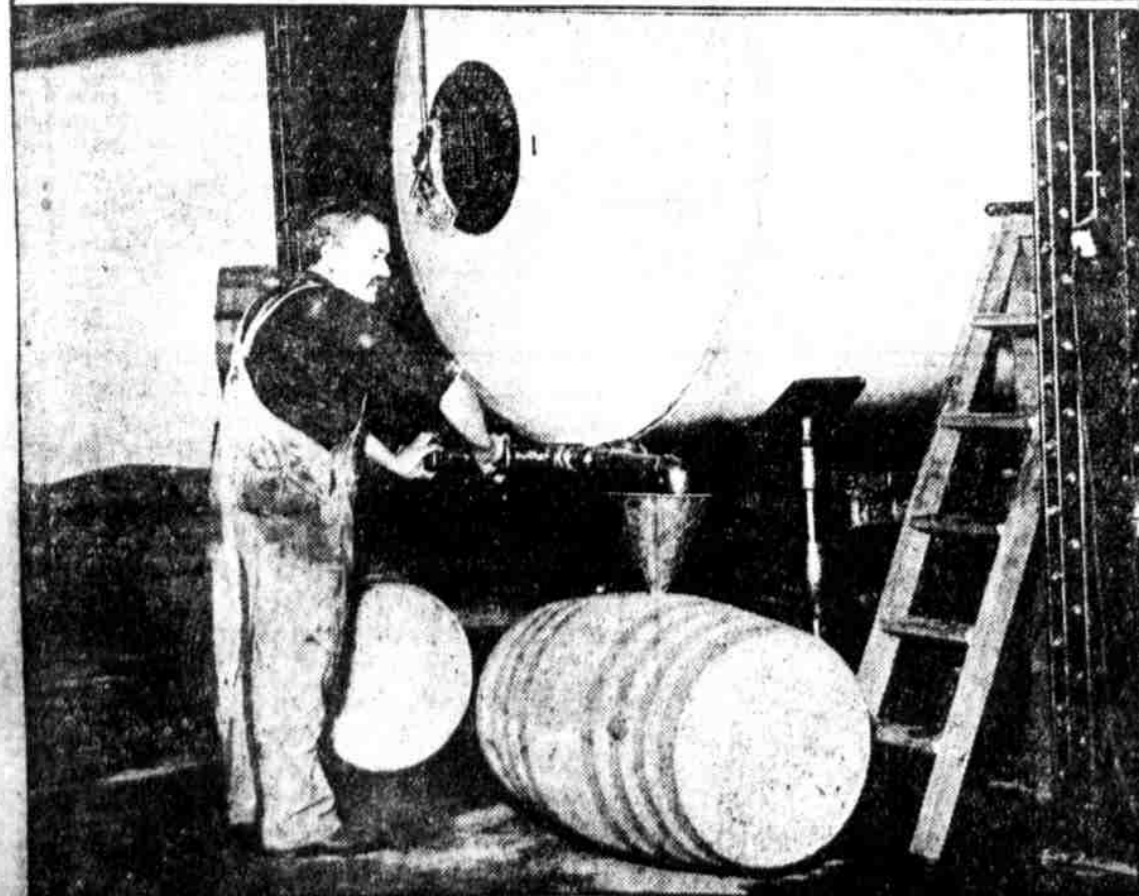
VALENTINE DOLL, 1416 North Wellington street, drawing extract from the huge tank into fifty-gallon barrels for shipment at the Lobeco Malt Extract Company's plant, Twenty-ninth and Parrish streets.