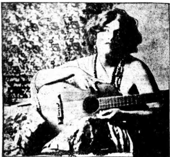
TORTOLA VALENCIA, the famous Spanish dancer, who will soon leave Madrid for an extended visit to this country. She is expected in Philadelphia.