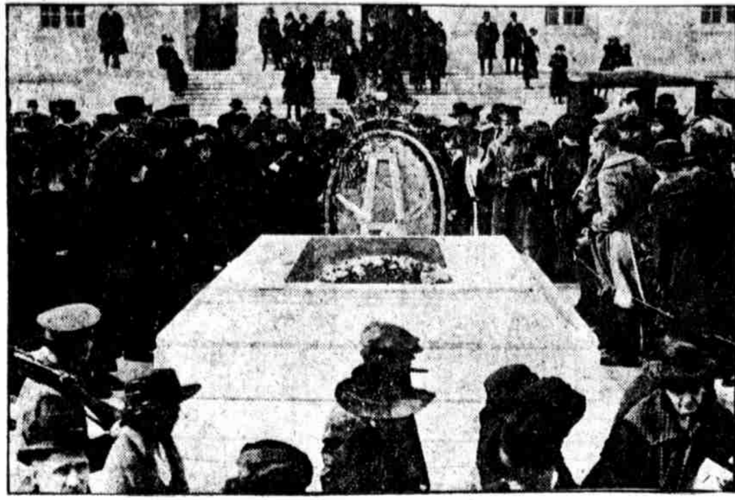
VISITORS AT TOMB OF "UNKNOWN." Thousands are flocking to Arlington Cemetery to get a glimpse of the resting place of the unidentified American soldier whose body was brought from France.