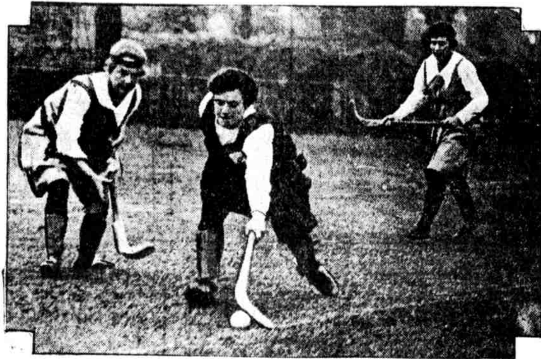
INVADERS CONTINUE TO WIN. The All-England hockey team went fast yesterday in scoring fourteen goals against one garnered by the Philadelphia Cricket Club girls. An English player is shown with the ball.