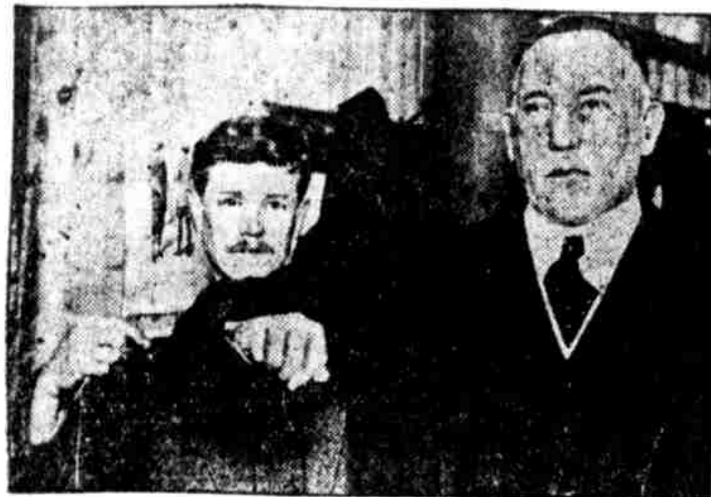
TAKING HIS MEASURE. Sir James Craig, leader of the Ulster group, visiting a Government instruction factory in Belfast.