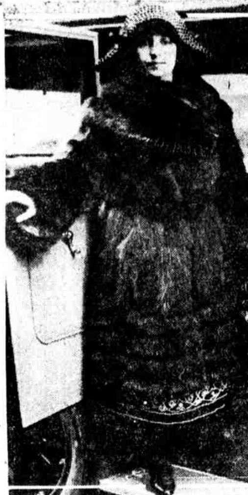
GALLI-CURCI, on her arrival in New York from Cleveland, was given a rousing reception.