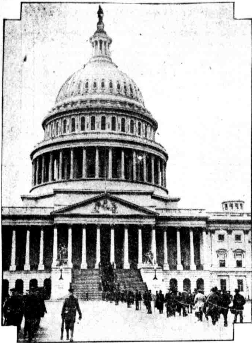
THEY MOVED IN ENDLESS PROCESSION. The great and the lowly walked through the rotunda of the Capitol to pay tribute to the unknown dead, lying in state. The roped path and guards are shown in etching.