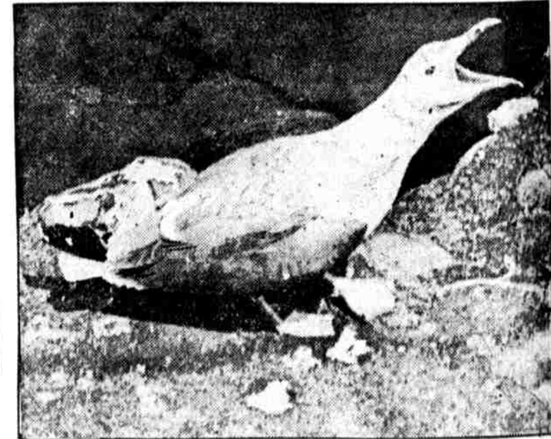
DID YOU EVER HEAR ITS CRY? It has a noon-day whistle of a Kensington factory beaten for shrillness. This Pacific gull, a resident of the Philadelphia Zoo, is registering hunger.