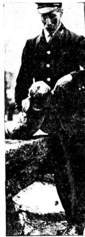
NUTRITION FROM A BOTTLE. Baby seal in London being fed by keeper.