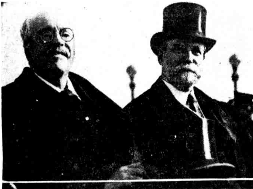
ON WAY TO CAPITOL. Arthur J. Balfour, chief of the British delegation in Washington, seated with Secretary Hughes, headed a long line of automobiles in a procession from the British Embassy.