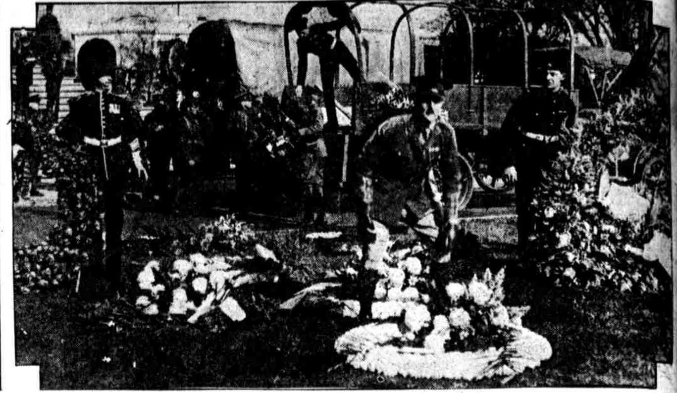
FLOWERS ARRIVING AT CAPITOL. Soldiers and marines of the British army and navy, with their officers, unloading floral tributes. They include tokens from King George and Queen Mary, as well as from the many official heads of Great Britain.