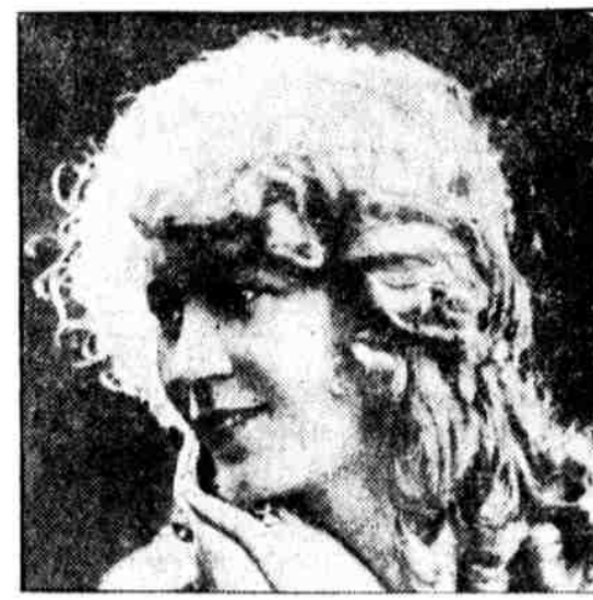
MADAME KARINA. The world-famous Danish dancer is soon to visit this country. She is now in France.