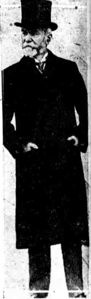
AMBASSADOR JUSSERAND, of France, host to many French folk.