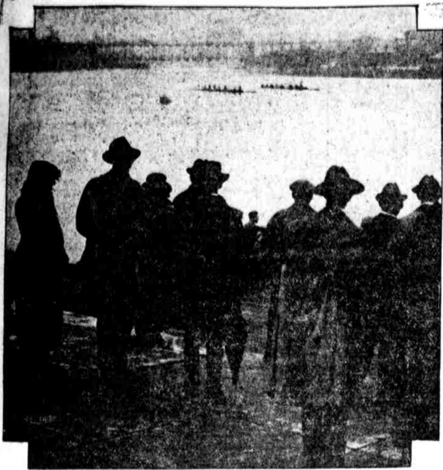
PENN OPENS NEW BOATHOUSE. The U. of P. crews took part in races on the Schuylkill in connection with the opening ceremonies at the $50,000 structure built along Boathouse Row.