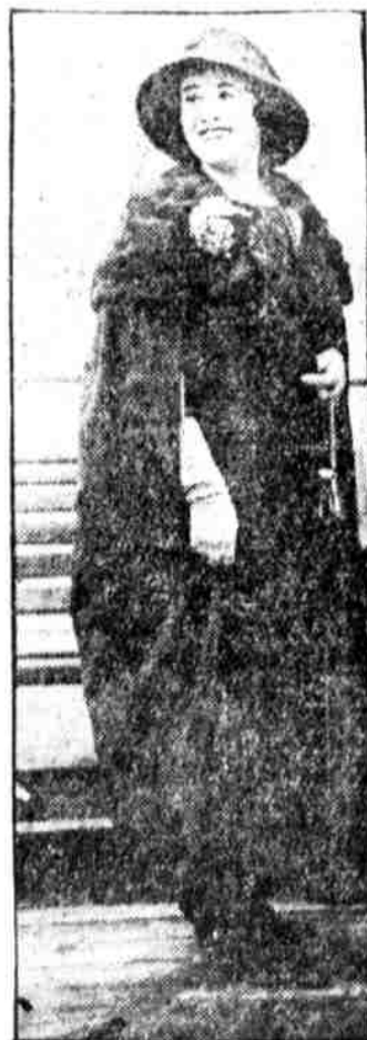
READY FOR THE ARMS CONFERENCE. Lord and Lady Lee arrive from England on the Olympic. They will also make a tour of the country.