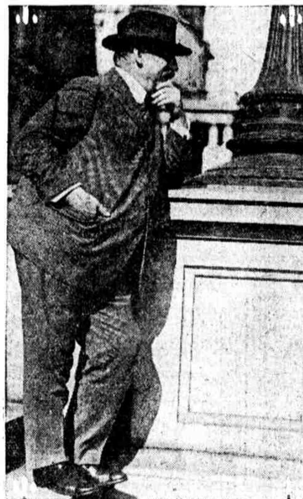
A PENNY FOR YOUR THOUGHTS. We surmise that Secretary of War Weeks is planning for the Arms Conference program.