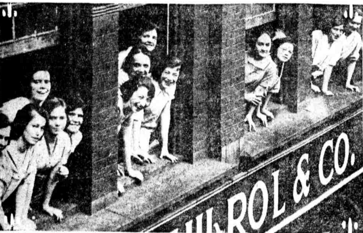
SAW FIRST CAR ON FRANKFORD "L." Frankford people were not the only ones who took a keen interest in the running of a trolley car over the "L" trucks. These girls, employed at a Delaware avenue factory, saw the start.