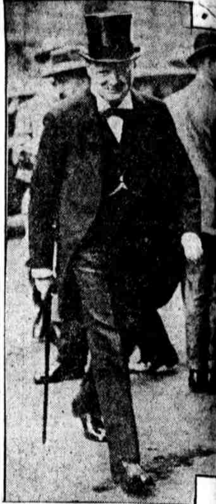
TAKING PART IN IRISH CONFERENCE. Two British Ministers arriving at No. 10 Downing street, for parley. Sir Gordon Hewart (left), Attorney General, and Winston Churchill, Secretary for the Colonies.