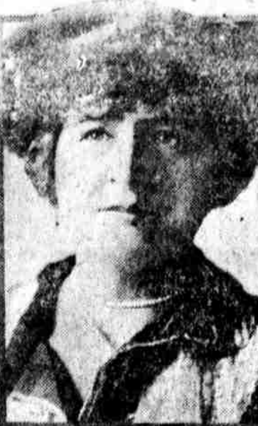
MISS ANNE MORGAN Paris society believes the report that the daughter of J. Pierpont Morgan and Ambassador Myron J. Herrick are engaged