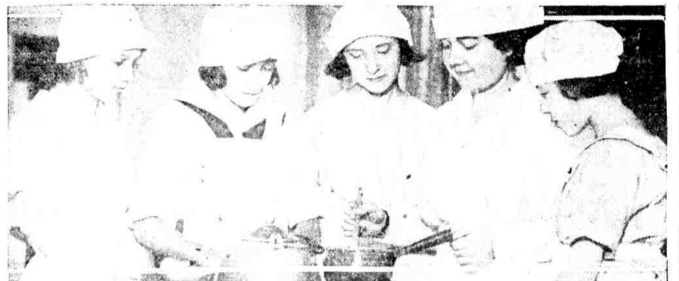
HOW TO MAKE A WHITE SAUCE. Exactly what Miss Pendlebury is showing some of the girls at the Campbell-Lyon School, Eighth and Fitzwater streets, where cooking is being taught in many of its branches.