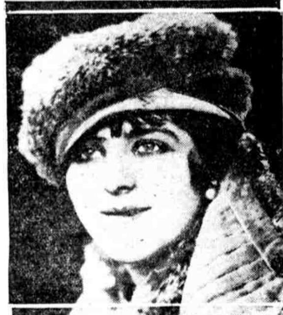
PARIS FASHION. A chinchilla cape, the collar is lined with smoke-color velvet, with turban to match.