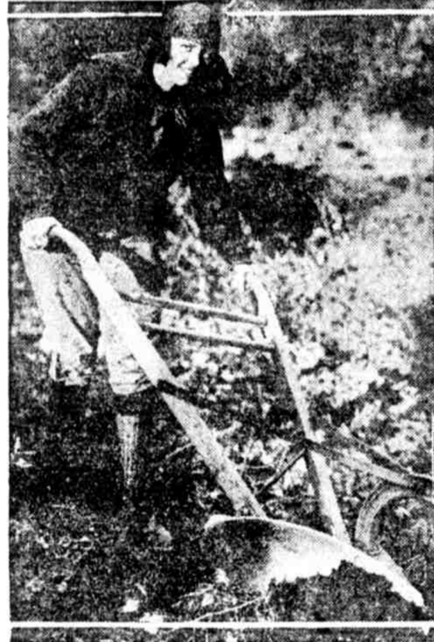
STUDENT FARMERETTE. She guides a plow, where practical farming is being taught to girls at Katonah, New York.