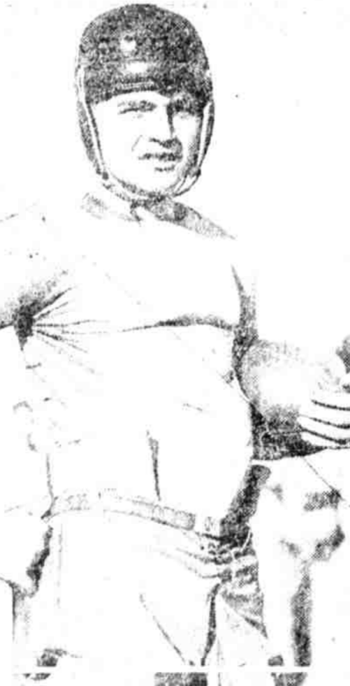
PIONEERS SHOW GREAT SPEED. The Central High School footballers were slightly stung by the clever work of the Frankford eleven, on Yellow Jacket Field, in Frankford, yesterday afternoon.