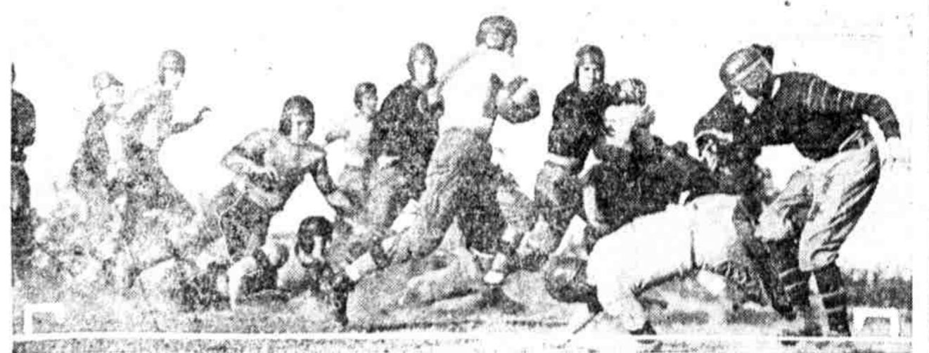
PIONEERS SHOW GREAT SPEED. The Central High School footballers were slightly stung by the clever work of the Frankford eleven, on Yellow Jacket Field, in Frankford, yesterday afternoon.