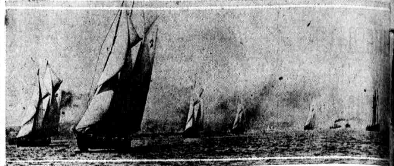
SCHOONER BLUENOSE WINNING. During the trial races of the Canadian contenders for the International Fishermen's Race, to be held off Halifax, tomorrow the Bluenose, with 2 marked on mainsail, will represent Canada against the Gloucester schooner Elsie, America's hope.