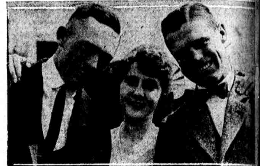
DO YOU KNOW THEM? Rogers Hornsby (left), champion batter of the National League. The fair one is Patsy Ruth Miller, movie actress. George Sisler (right), of the St. Louis Browns.