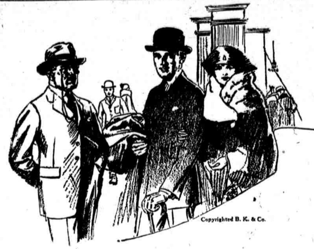
—an investment in good appearance.