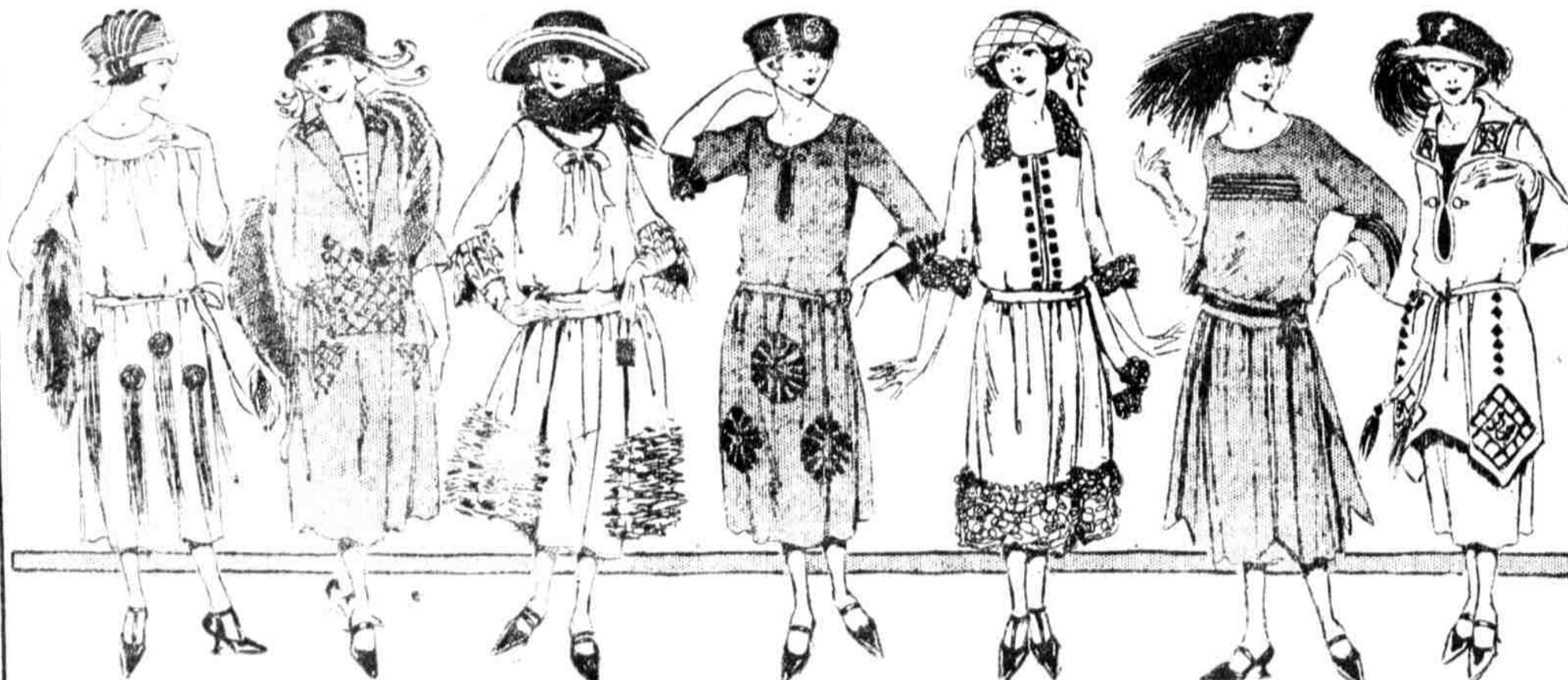
Canton Crepe, $10

Mostly blues, browns, blacks Misses' Sizes, 14 to 18 Women's Sizes, 36 to 44 Extra Sizes up to 52