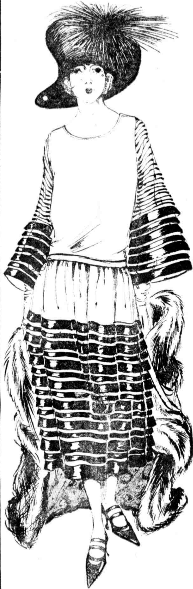
Canton Crepe, combined with Georgette and Silk Braid, $10

Fabrics Are Mostly Canton Crepes, All-Wool Tricotines, Heavy Crepes de Chine, and Smart Combinations—But There are Satins, Serges, Jerseys, Velveteens, Besides