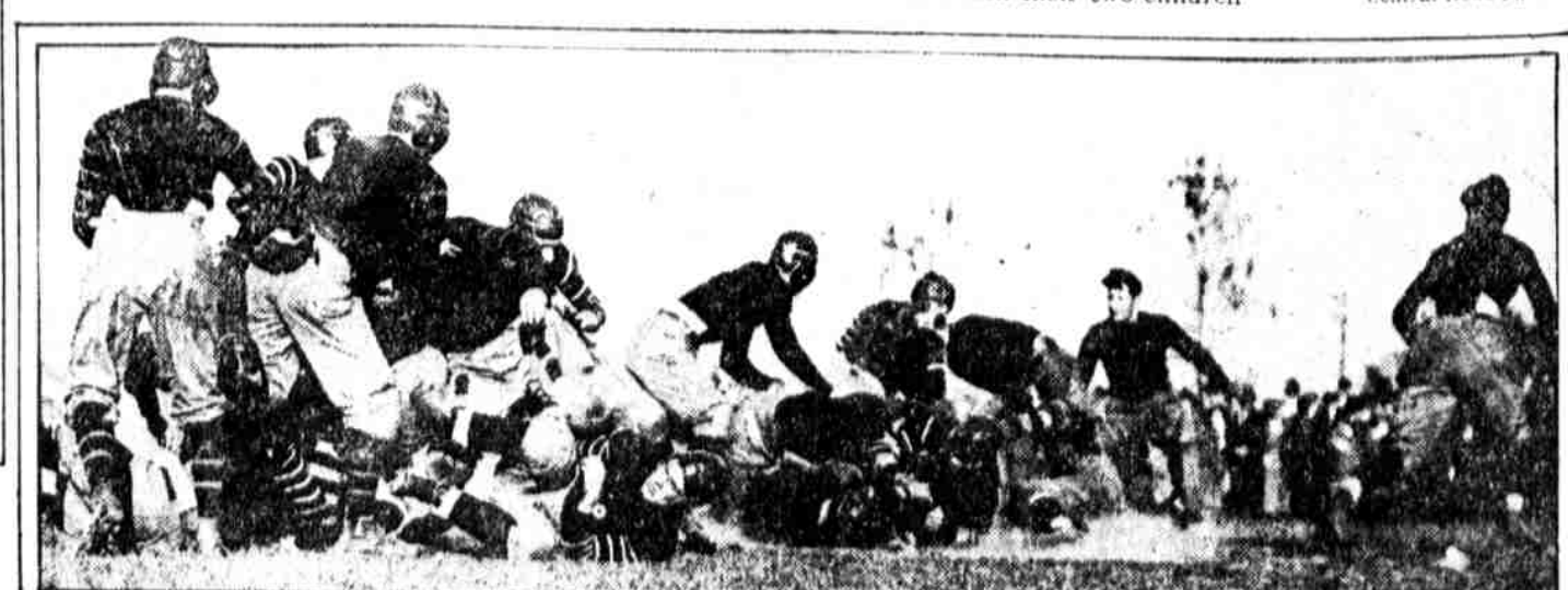
SCHOOLBOYS AT IT. Scholastic football had a large program yesterday, when many of the Philadelphia and nearby schoolboys got in action. The photographer snapped a play in the game between Ceneral High and Lower Merion. The local football players were in possession of the ball at the time. Central won