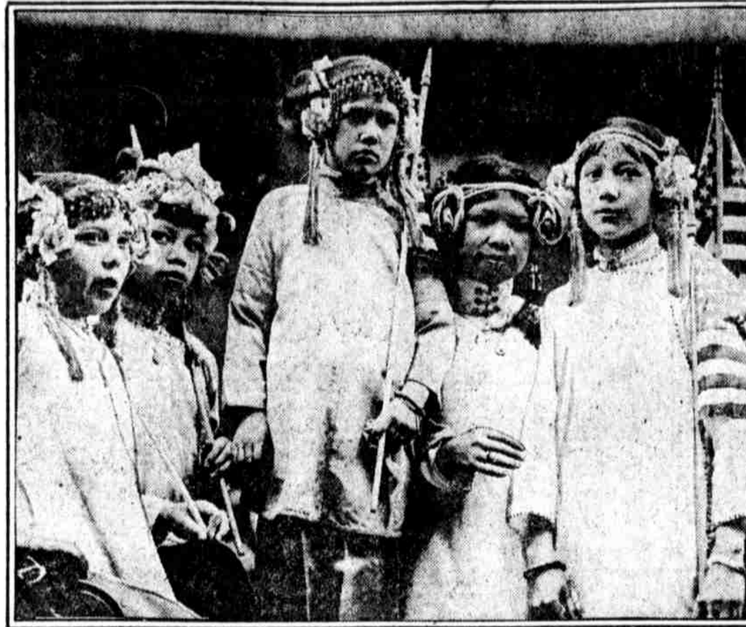
IN CHINESE PARADE. This quintet of pretty Chinese children filled an automobile in the procession as it passed down Chestnut street. It was the celebration of the tenth anniversary of the Chinese Republic.