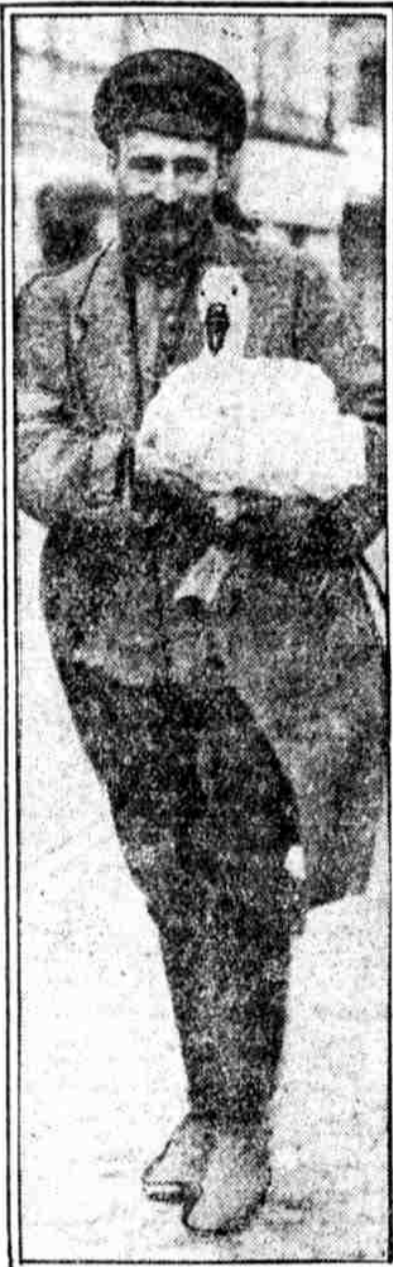
REVIVAL OF BUSINESS. A Russian family head on his way home from market.