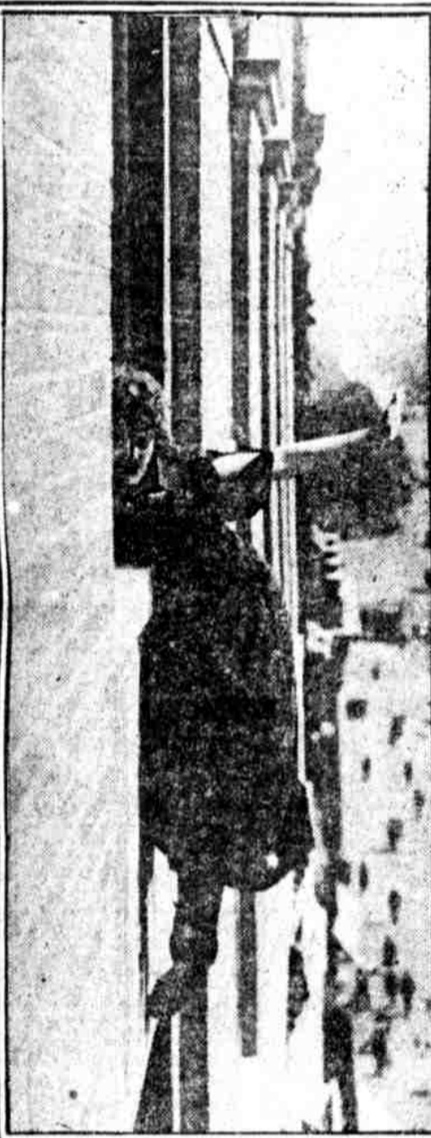
RISKY SPORT. Hanging from a window of a Washington hotel as frightened spectators watch from street.