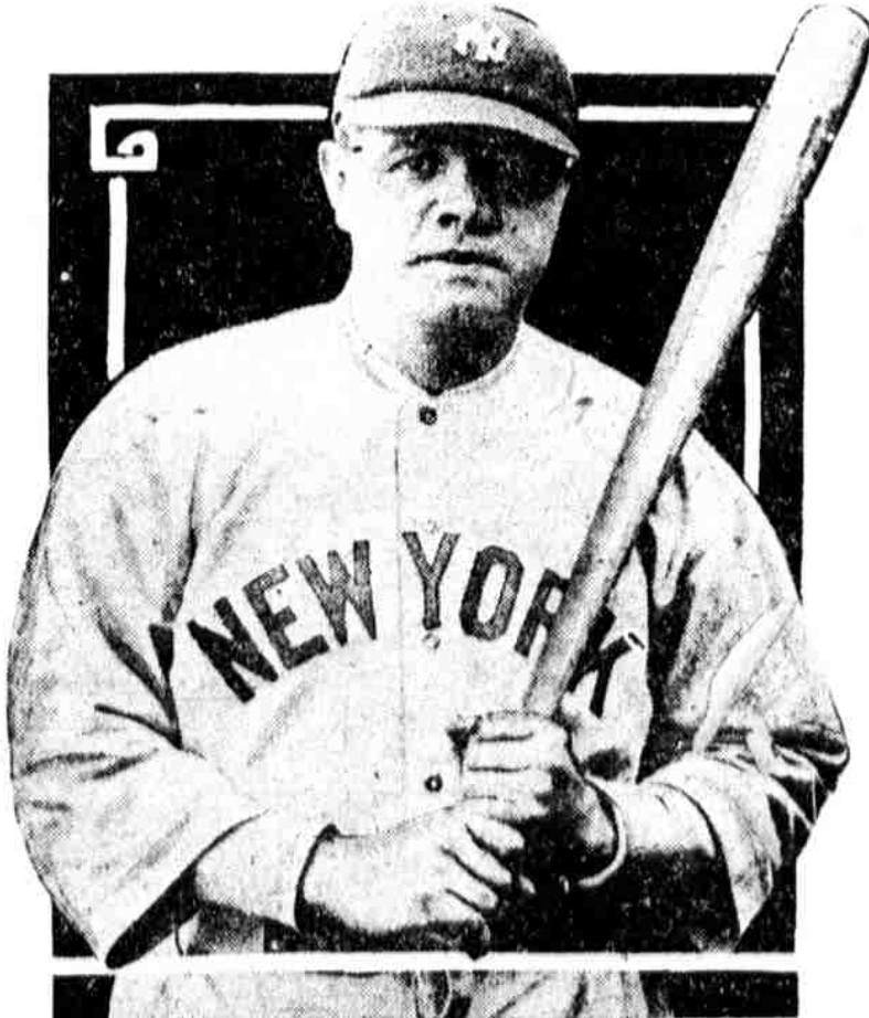
Babe Ruth submitted to an operation for an abscess on his left elbow and may be unable to play in the fourth clash between the Glants and