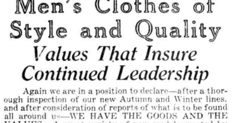
Men's Clothes of Style and Quality Values That Insure Continued Leadership

THIS is the season when we are all cleaning and re-decorating our homes, getting ready for the winter when one is in the house so much. Some things will need renewing, but rugs are a part of the furnishings which last for many years, especially if they are taken care of and kept clean. This can only be done by having them properly cleaned by a reliable firm like that of Barg Bros., 1113 Chestnut Street.