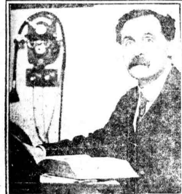
LORD DAWSON. The former British ambassador to the United States and now ambassador to the United Kingdom. He went to Scotland recently to attend Premier Lloyd George.