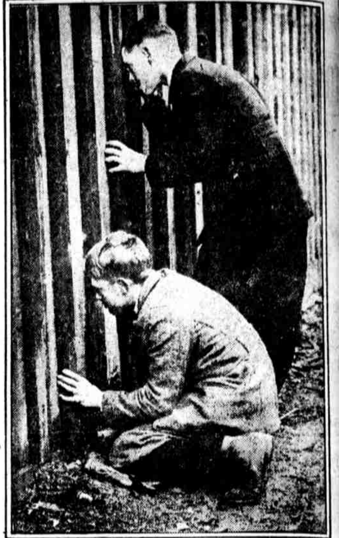
AN EYEFUL. Two Gotham citizens were very early. Only early boys found knotholes at the opening game of the World Series.