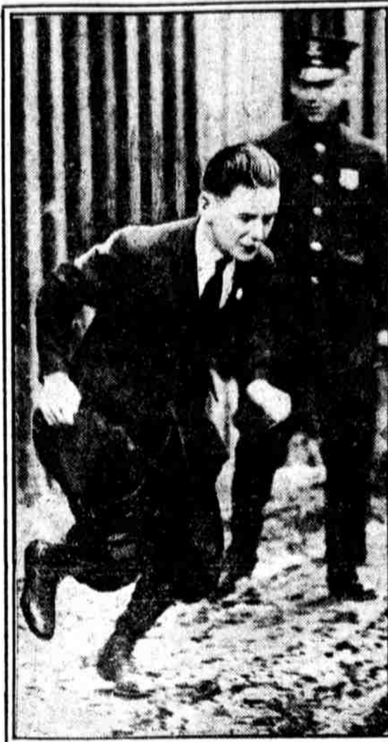
HERE A "COP" ARRIVED. He almost reached the top of the fence of the Polo Grounds when the bluecoat spied him.