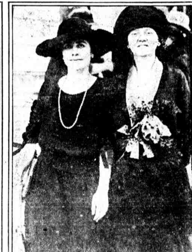
MRS. CALVIN COOLIDGE (left), wife of Vice President, and Mrs. Marshall, wife of ex-Vice President, following a luncheon to wives of Senators.