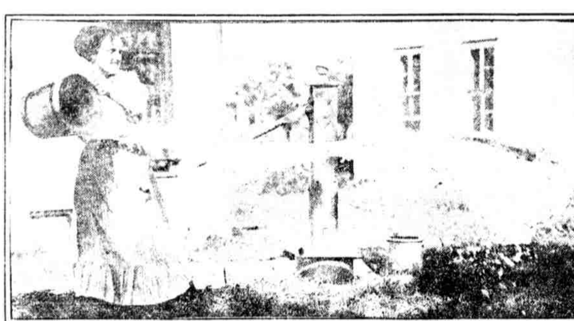
WATER IN ACTION. Victor Lauder, of Spafford, Idaho, performed the difficult feat of photographing a full pail of water in the air as it was thrown straight out by his wife. It was in a family quarrel.