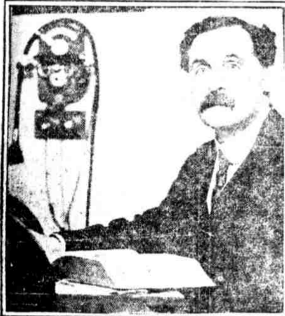
LORD DAWSON. Day ... to ... of England. He went to Scotland recently to attend Premier Lloyd George.