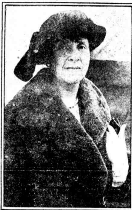
MRS. HAROLD F. MCCORMICK (left), wife of the head of the International Harvester Company and daughter of John D. Rockefeller. At the right, Miss Walska, who in private life is the wife of Alexander S. ...