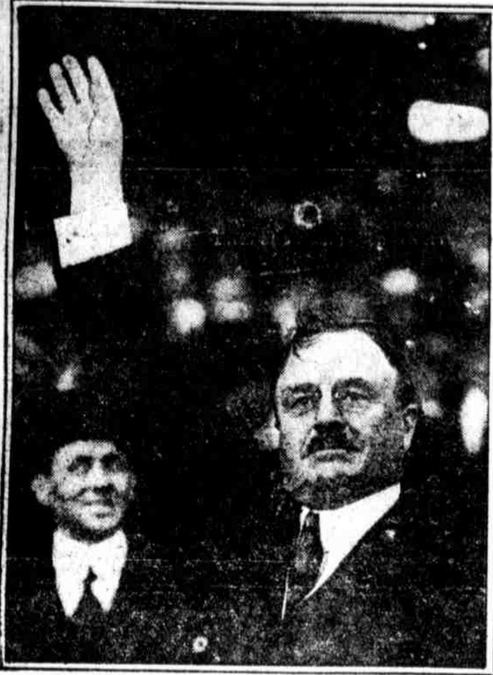
THE FIRST BALL. Mayor Hylan tossed the ball to the center of the diamond as the teams representing New York started battle in the World Series.