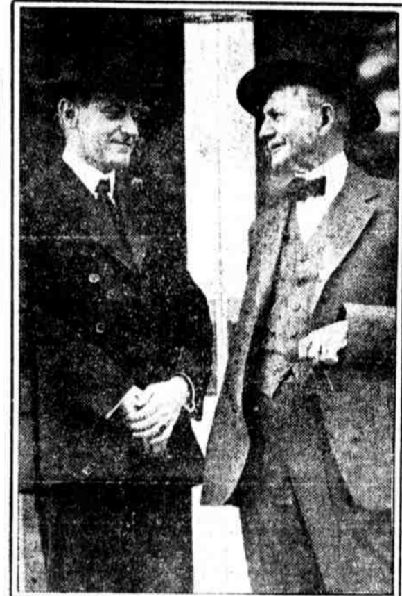
MR. ... and ... at ... with Vice President Coolidge.