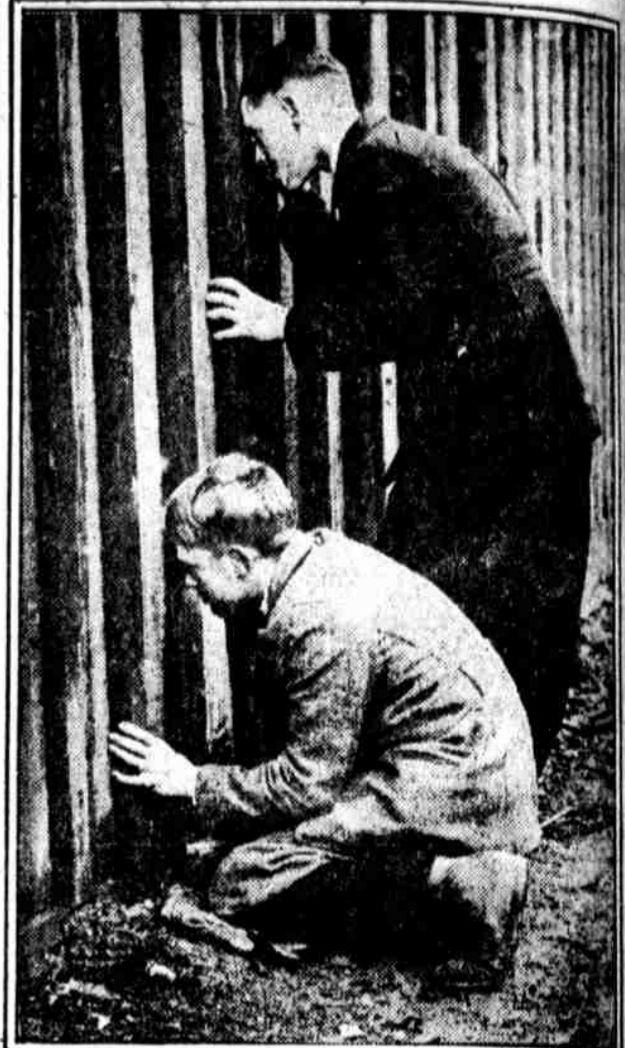
AN EYEFUL. Two Gotham citizens were very early. Only early boys found knotholes at the opening game of the World Series.