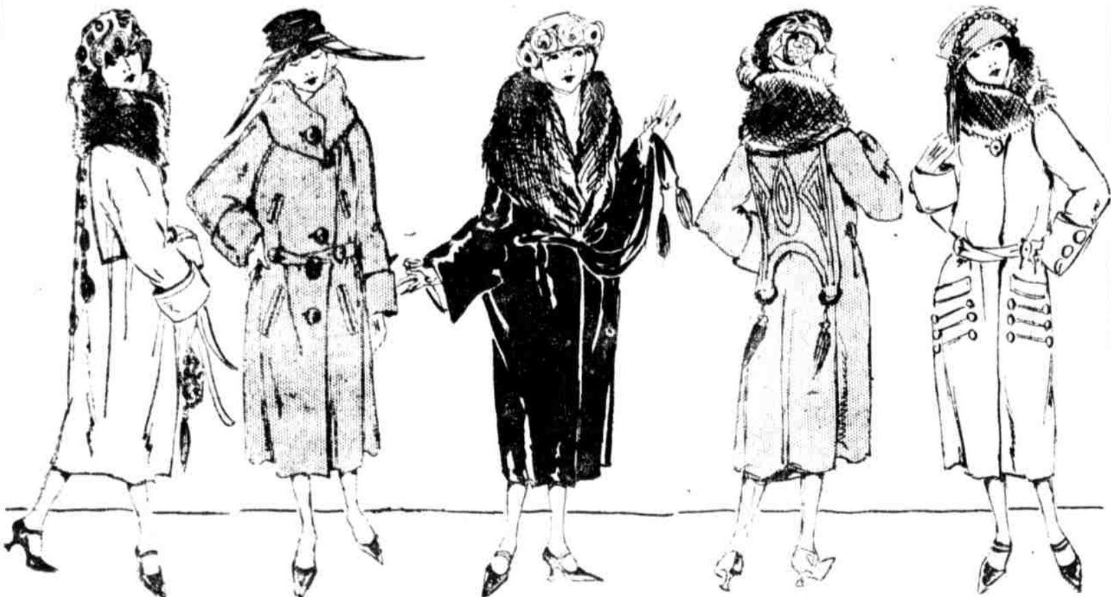
Bolivia with Fur Collar and Embroidery $19

Mostly With Fur Collars—Some With Huge Fur Collars and Deep Fur Cuffs—Some With Deep Fur Borders, Besides