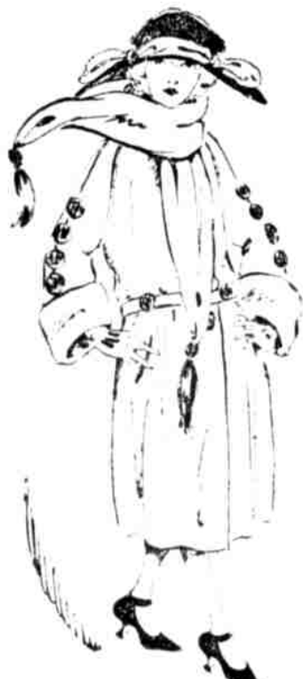
Bolivia with Throw-tie Collar and Tassels $19

Wrap-coats with embroidered backs that run into embroidered sleeves—they're stunning! —Gimbels, Subway Store