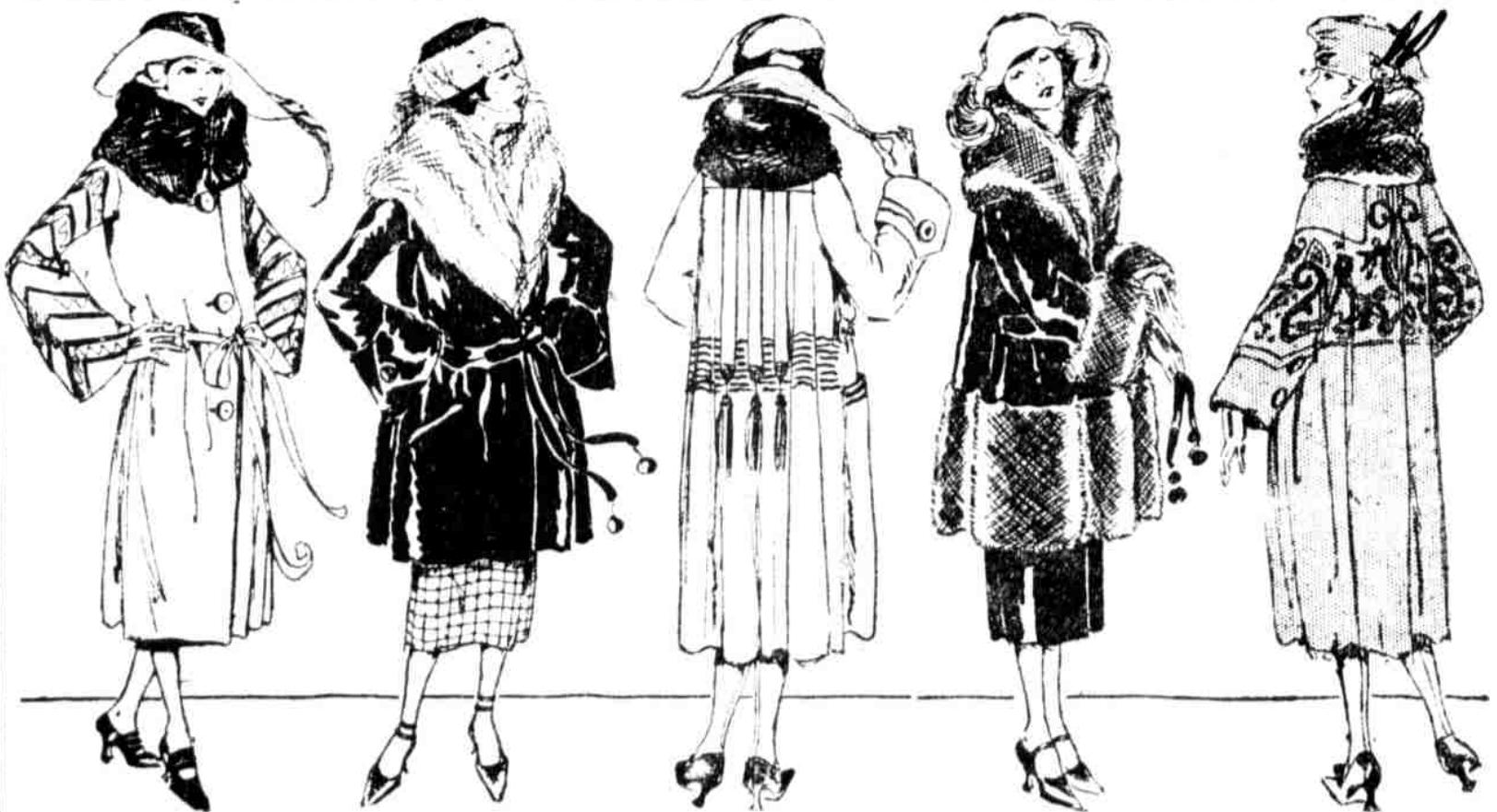
Velour with the New Embroidered Flare Sleeve $19

Plenty of the new mannish-style sports coats included—some with big fur collars. —Gimbels, Subway Store