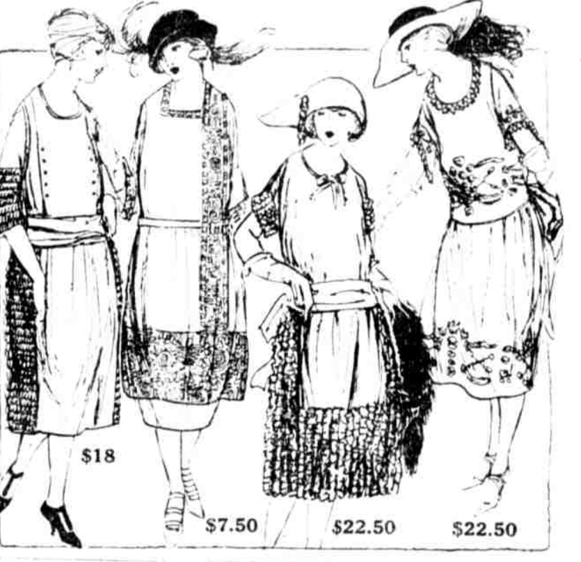
$18 $7.50 $22.50 $22.50

Tailored tricotine dresses in extra sizes, 42½ to 48½, are $39.