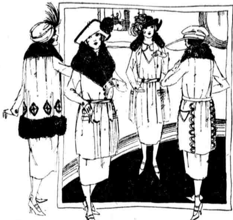
$37.50 $69 $25 $57.50