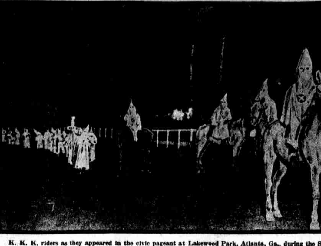
K. K. K. riders as they appeared in the civic pageant at Lakewood Park, Atlanta, Ga., during the Southeastern Fair in the fall of 1920