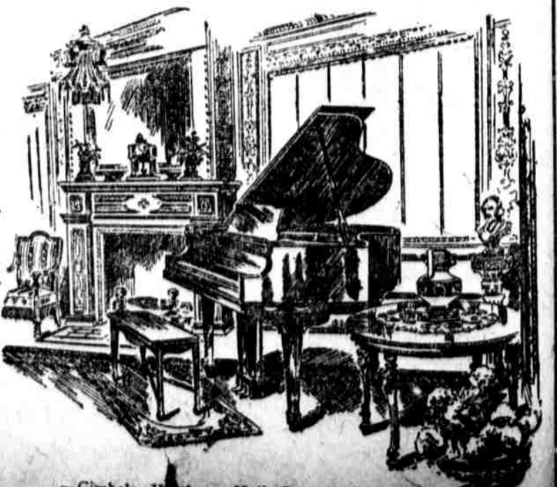
—Gimbels, Hardman Hall, Seventh floor