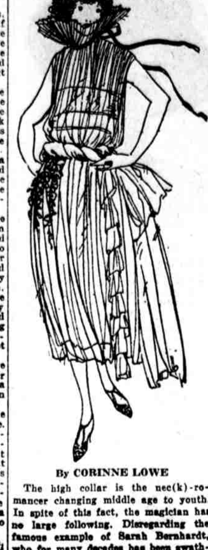
By CORINNE LOWE. The high collar is the neck-remancer changing middle age to youth. In spite of this fact, the magician has no large following. Disregarding the famous example of Sarah Bernhardt, who for many decades has been wearing her throat in scarfs, the average American woman prefers her boat-shaped neckline without any softening influence. And, although a few high collars appeared this summer, the mode has never really taken with the mass of women.