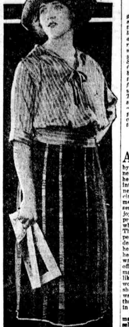
Old Masters She wears white oxford with it now, but later on she'll change to tan ones, for it is a costume that can be worn just as well under the winter coat. The comfortable fashion of plaits in the trim skirt is made smart by having the striped design of the material go across instead of up and down, like that in the waist of pussywillow taffeta. Bars of a darker thread emphasize the tiny stitiches around the brim of her hat.