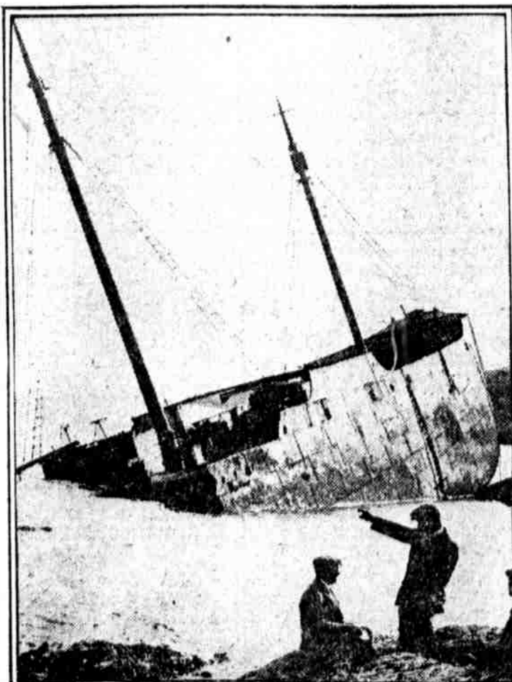
THIS IS HALF A SHIPWRECK. The Broadmayne ran aground off the English coast. Wreckers cut it in two, but the half they tried to tow away got itself wrecked again.