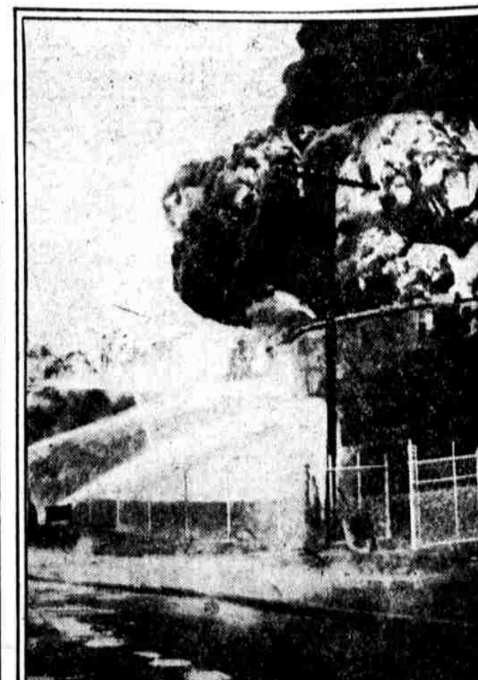
FLAMES ARE SEETHING from a gasoline tank at the Gulf Refining Company, Fifty-eighth street and the Schuylkill River. Three firemen collapsed from heat.