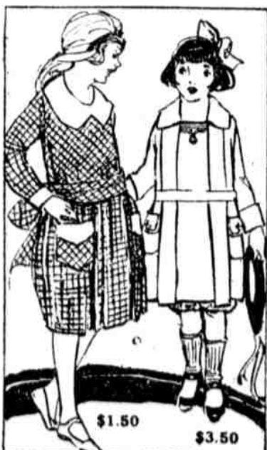
$1.50 $3.50 (Market)

Fine heavy pillow cases, 42x36 inches, are special—just 600 of them. (Central)