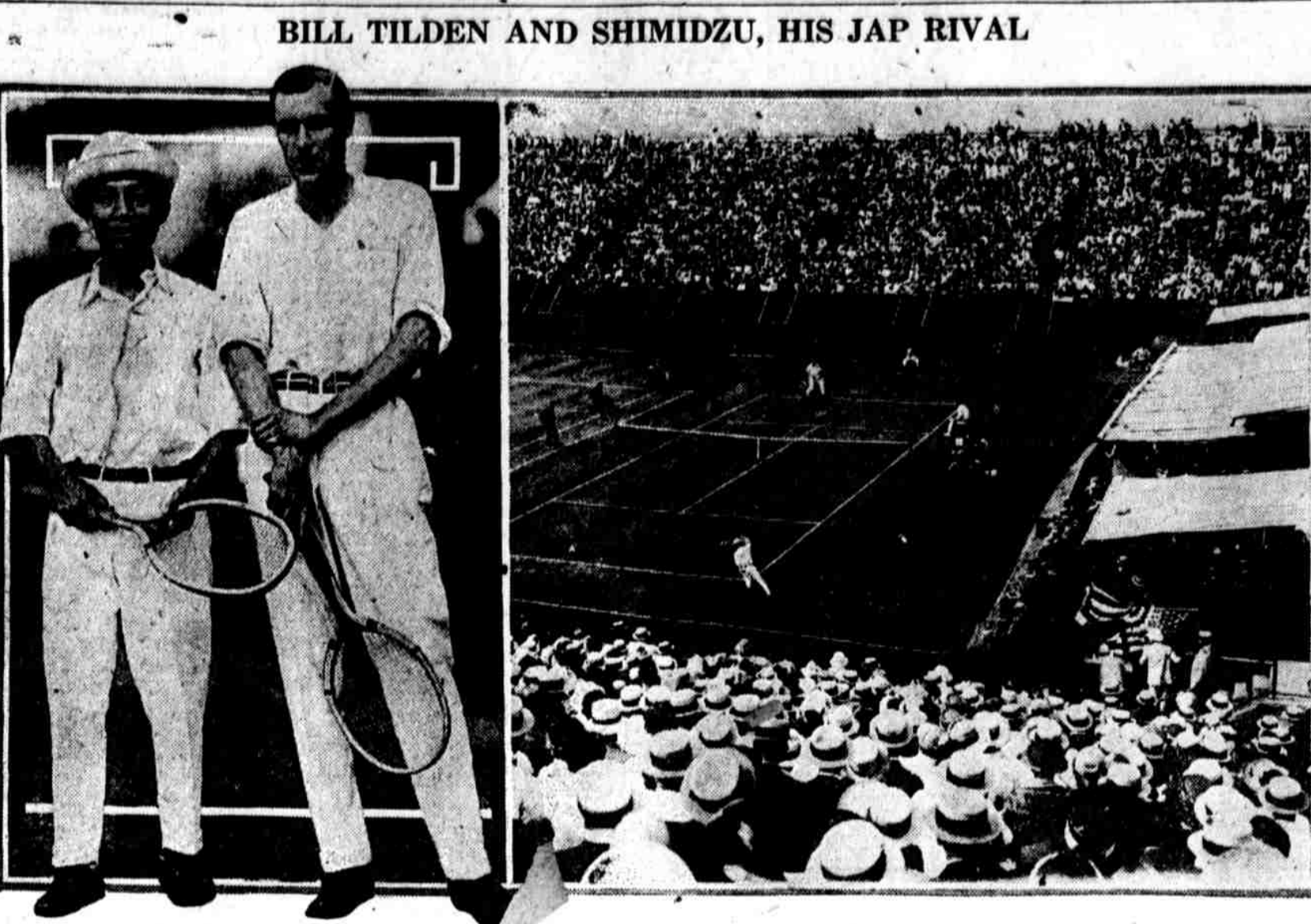
The world's tennis champion got the shock of his life in the Davis Cup singles when his Oriental opponent came within two points of winning the match. Tilden, by playing super-tennis, scored a triumph. The court scene shows the famous rivals in action at Forest Hills.

Final Shoot of Season The trap and final shoot of the Chestnut Trappers League for the season of 1921 will be held this afternoon at the trap house of the Chestnut Club of Philadelphia.