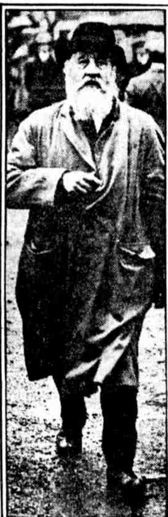
COUNT PLUNKETT at Mansion House, Dublin, to assist in peace making