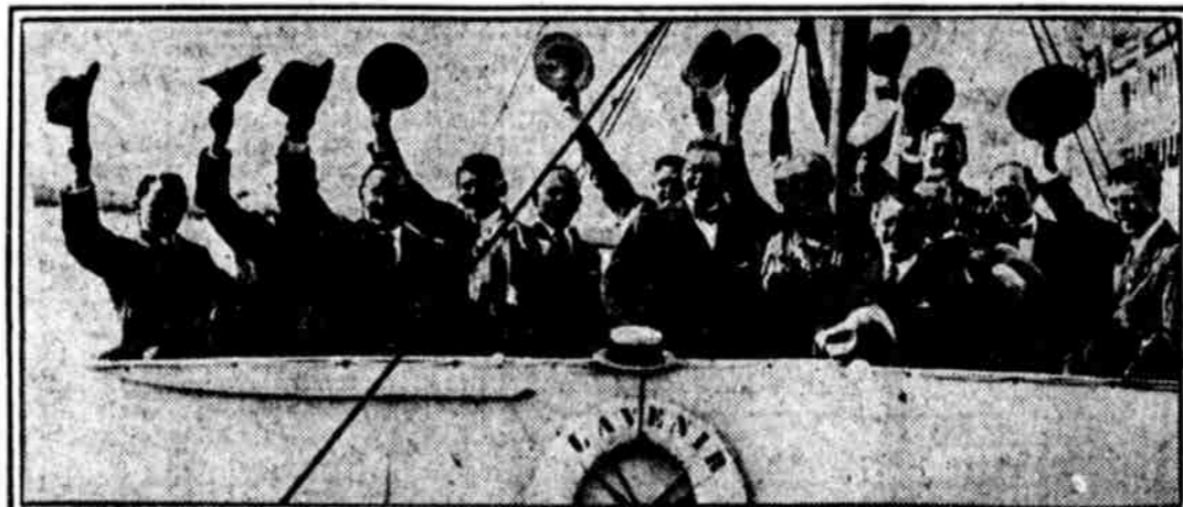
AMERICAN LEGION PILGRIMS. They are seen as they left the steamship George Washington in port at Cherbourg, France. French naval and army officials were at hand to welcome them. They visited many of the battle fronts where Americans fought.