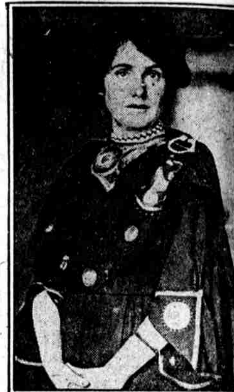
ACTIVE IN IRELAND. Mrs. Eamonie Valera, wife of leader of forces which favor an Irish Republic. U.S.