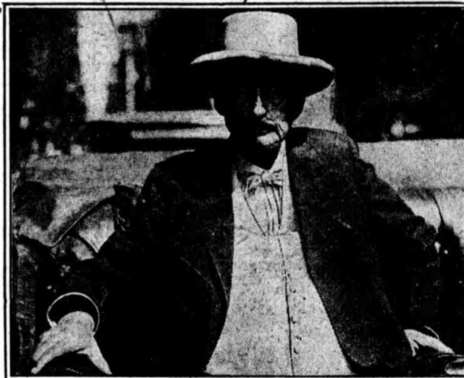
AFTER HE REGISTERED. United States Senator Peppose, seated in his automobile, as he left 246 South Twelfth street.