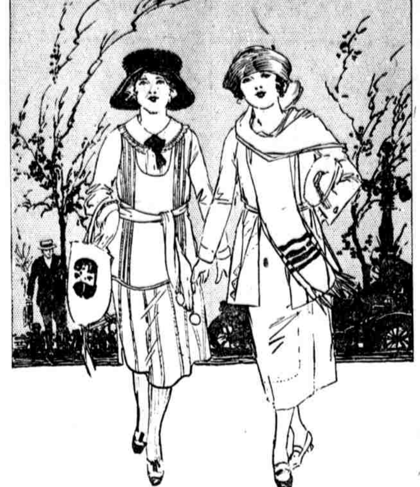
Walking Down to Work in the Morning Is Good, Healthful Exercise for the Business Girl Who Found Hiking a Joy During Her Holiday

MEMBER all the resolutions you made while you were hitting the trail of the lonesome pine? Member how good you said you felt after your holiday? How about your resolutions now?