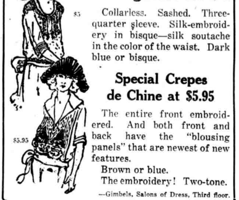
Collarless. Sashed. Three-quarter sleeve. Silk-embroidery in bisque—silk soutache in the color of the waist. Dark blue or bisque.

Suit-Waists That Are Over-Blouses—Special Georgettes at $5