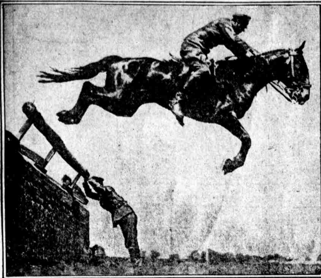
SPECTACULAR JUMP. Looks as if there wasn't a place to land as this horse carries a Bulgarian officer over the barrier at Sofia, Bulgaria, during a recent riding exhibition. It was conducted by the Bulgarian army