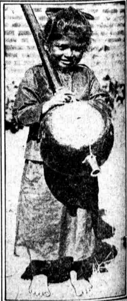
INDIAN GIRL MUSICIAN. She has arrived in London with a group from India