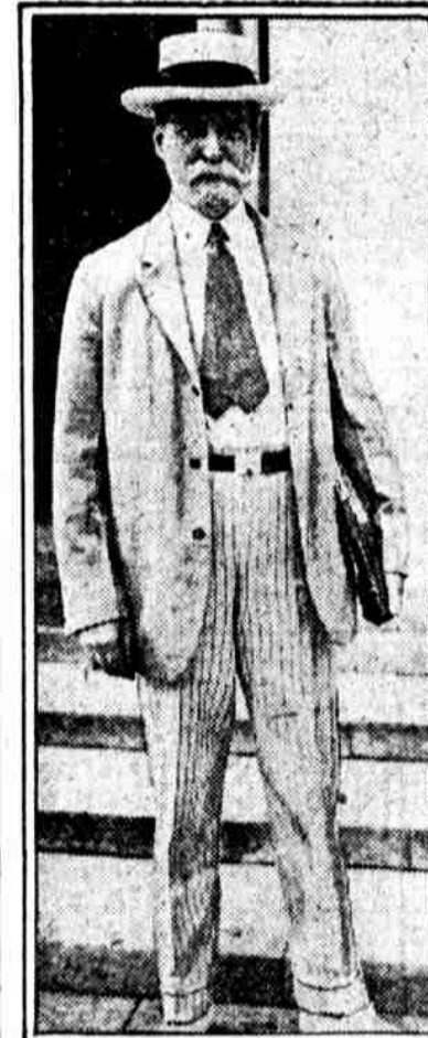
BUSY OFFICIAL. Secretary of State Hughes shown leaving White House