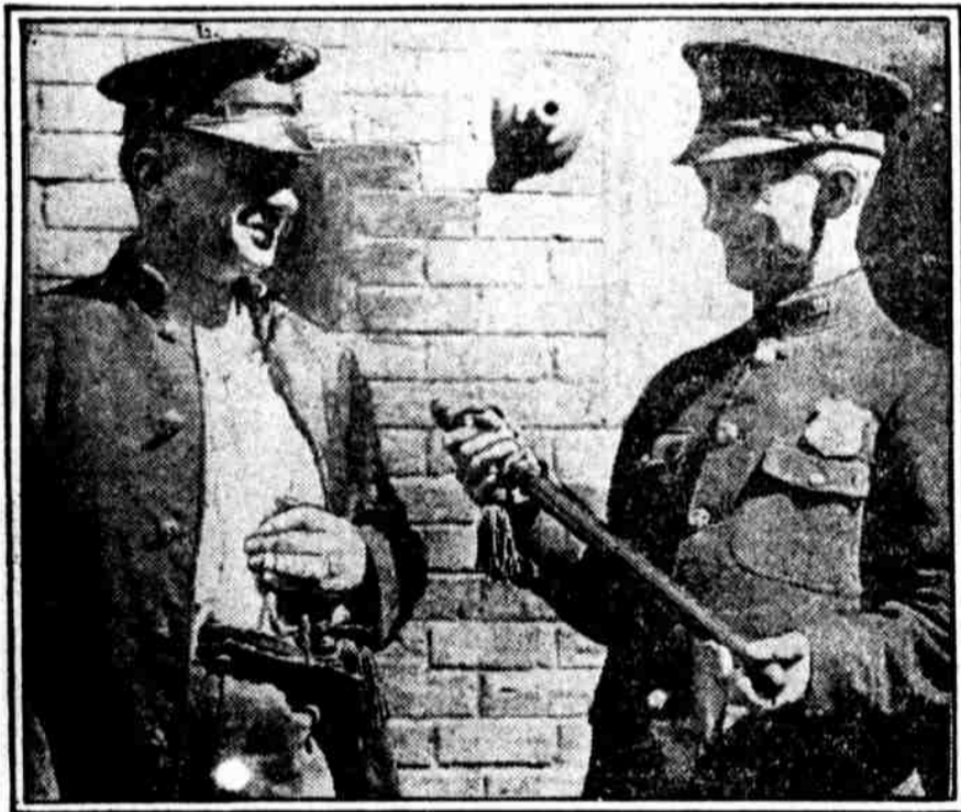
OLD AND NEW WAY. Philadelphia patrolmen must hereafter carry police clubs in their hands and not on a belt or on their hip. "Drum Major" style of swinging club is also prohibited