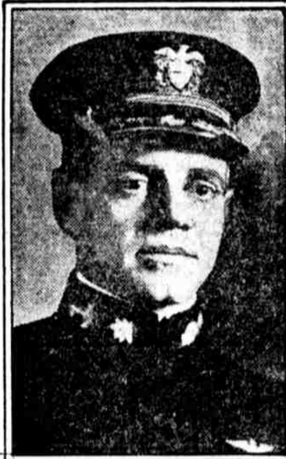
APPOINTMENTS. Rear Admiral William A. Moffett (left), new chief of the Bureau of Naval Aeronautics, and Captain Henry C. Mustin, who has been named as the assistant chief of the bureau