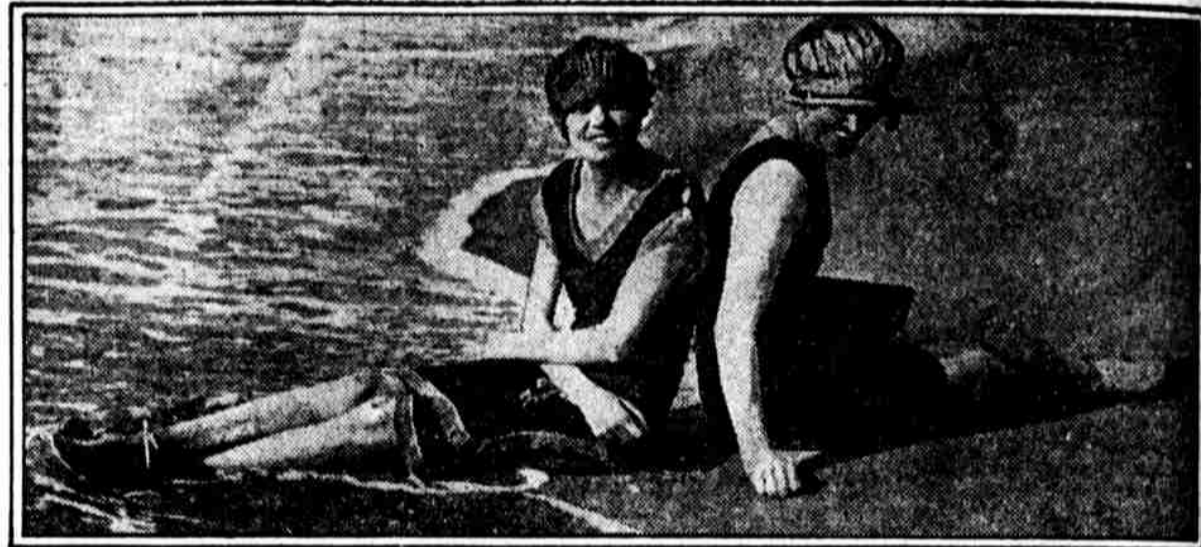
AT DEAUVILLE, FRANCE. Two English travelers are taking a sun bath on the sands of the French resort, where society from many lands now enjoys the season's height