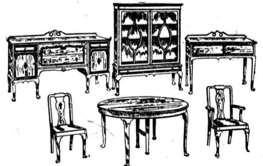
Suite, as illustrated, is of the finest construction, solid walnut (no gum wood substitute), full dust-proof construction, framed-in drawer bottoms, mahogany interiors, buffet 66 inches long, 54-inch top extension table, beautiful console effect serving table, china closet with lattice decorated door fronts, magnificent set of chairs. To be closed out at $375 the Suite. —Gimbels, Sixth floor.