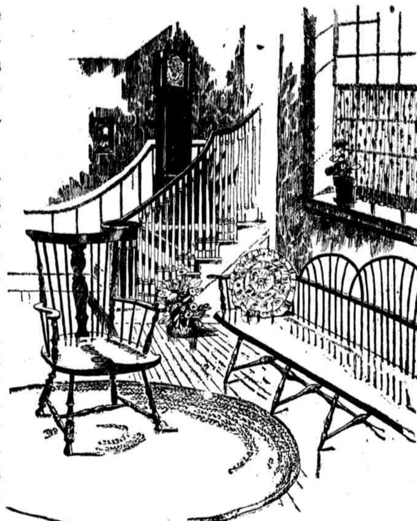
There is a charm in this grouping of quaint Furniture, after the style of Colonial days, that forms a restful and pleasing picture. The Mahogany-finish Windsor Chair has been reduced to $10.75. The handsome Hall Clock, of solid mahogany, has the Herschede movement, with silver dial containing the Moon's Phases, enriched by gold numerals. It is 8 feet high, with 22 1/2-in. base—now $199.00.

What is more, Odd Suites, Parts of Suites and Suites in designs that cannot be replaced, as well as hundreds of Single Pieces, accumulated from the record-breaking selling, are crowding this Extraordinary Event with opportunities and economies that will interest thousands to the last hour of the last day of the Sale. With the advantages, of course, in favor of those who come now.