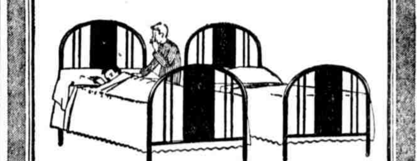
This Barcalo twin is number 1150, finished in rich mahogany, walnut, oak, or ivory enamel.