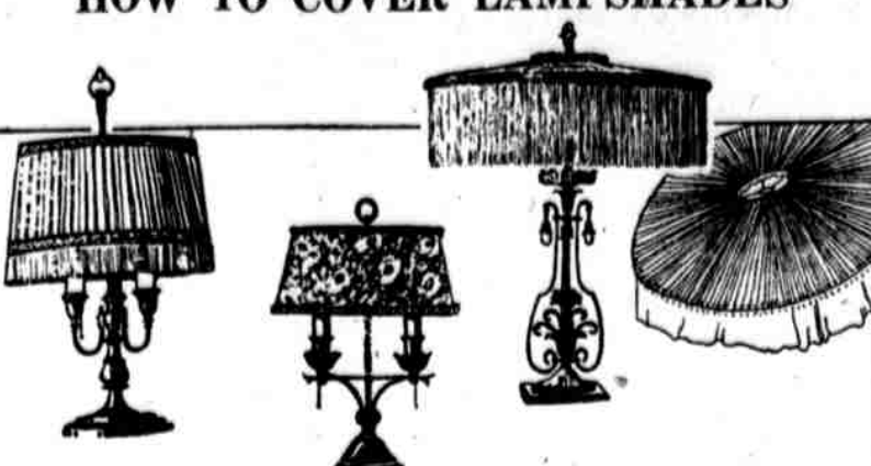
New coverings make an old lampshade look new and festive, and the work goes quickly and easily as soon as you get the hang of it. Above are several different styles

There are so many colors, materials and trimmings one has difficulty some. Where plaited georgette is to be used. Jack or Jane to be used is about as hard as the work. times making a decision; but the stores the lining is put in last. For a twenty-always will show the colors over a light six inch shade, five widths of georgette