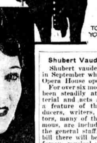
MARY MILES MINTER, 'THE LITTLE CLOWN' Regent.