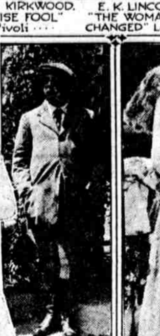
E. K. LINCOLN, 'THE WOMAN GOD CHANGED' Locust.