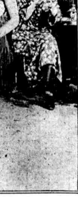
JOHN PHILIP SOUSA, 'WILLOW GROVE' Strand.

After the ceremony the following day Dick managed a word with the maid of honor. 'You sure were a brick,' he told her gratefully, 'putting me wise how to deal with this thing. By the course, it was only the excitement, but—'