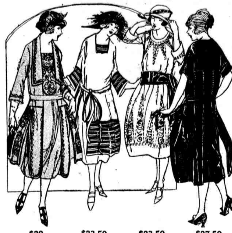
$29 $23.50 $23.50 $27.50