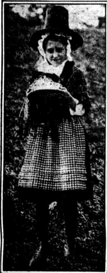
HOLDING THE CROWN. Ready to crown the bard at National Eisteddfod in Wales. C. S. P.