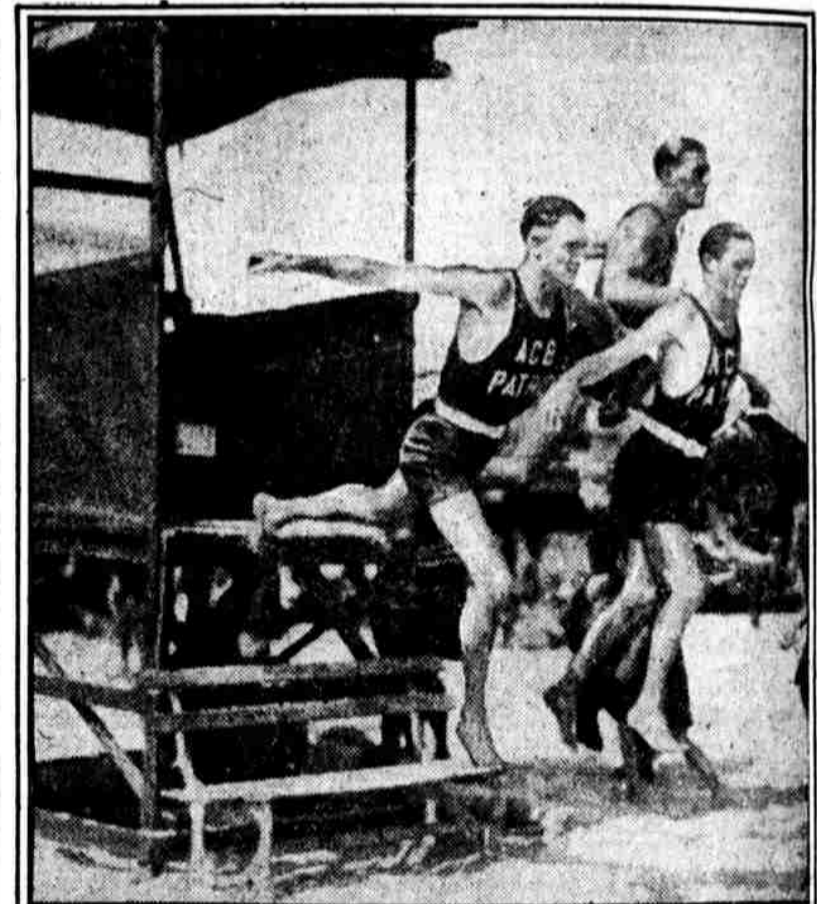
ANSWERING A CALL FOR HELP. Three members of the Atlantic City beach patrol jump from their station as a cry from the surf is heard.