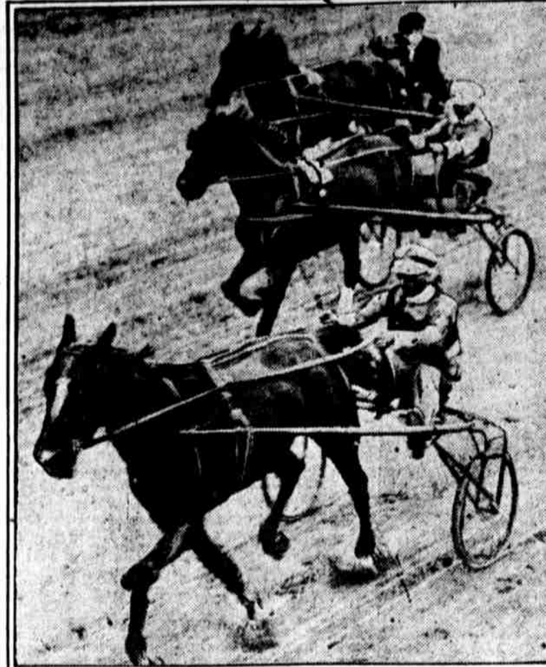
MADAM DILLON (in foreground) in the second heat of The Directors, 2:17 trot, was the winner. This horse finally won the Joshua Evans Cup for this event.