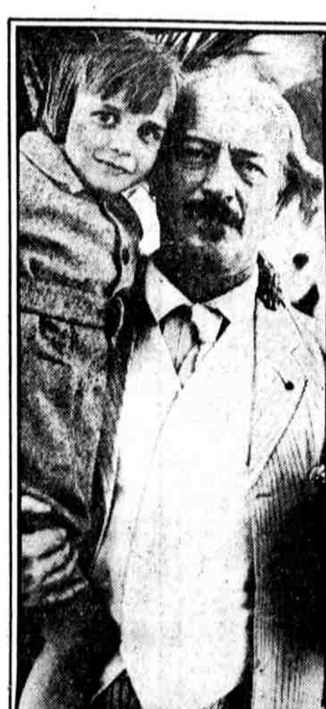
TWO STARS. Little Jackie Coogan, of movie fame, called on Ignace Paderewski at the latter's California ranch.