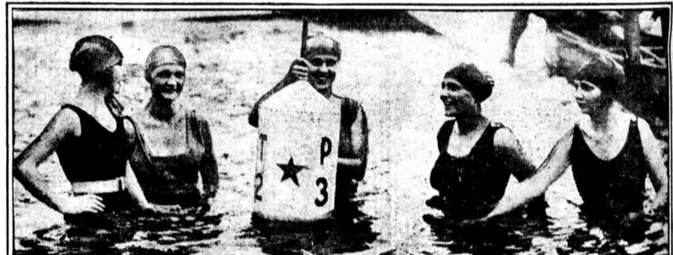
PLAYED ON LAND AND WATER. The girls at Lake Hopatcong, New Jersey, have a "put-and-take" top that they use in the water. The game is played in the same manner as in parlor or office. Bathing suits must have pockets, so that the pennies can be carried into the water.