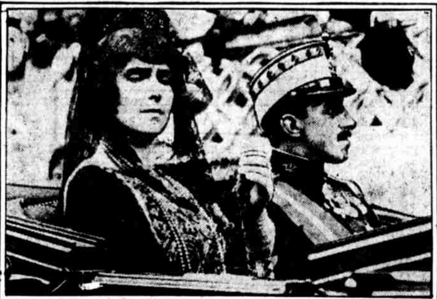
SPANISH ROYALTY. King Alfonso and Queen Victoria photographed during their recent visit to Burgos, Spain, where they received a wonderful ovation. Uprisings against Spanish troops caused them much concern.