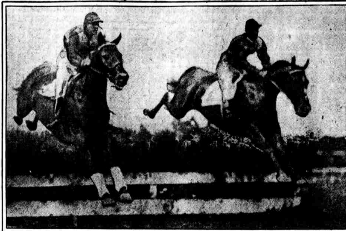
OVER THEY GO. At the last jump during one of the steeplechase events at the Phoenixville Fair. The two leaders were going neck and neck. Hundreds saw the close racing during the week's program, which ends this afternoon.