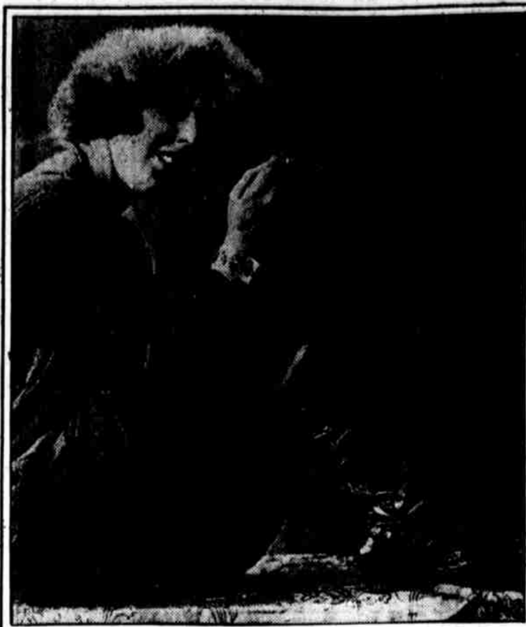
BACK FROM SOVIET RUSSIA. Louise Bryant, in Russian attire, at her hotel in New York. She is the widow of John Reed, the American writer, who died in Moscow last year.