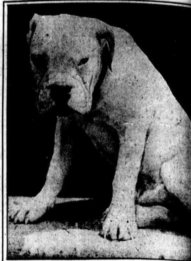
LADDIE BOY'S RIVAL. While President Harding was away on his recent tour, this pedigree bulldog arrived at the White House. "Oh Boy" is his name.