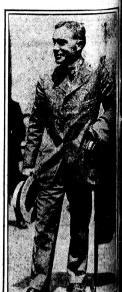
JOHN D. ROCKEFELLER, Jr., as he left on mission to Peking, China.