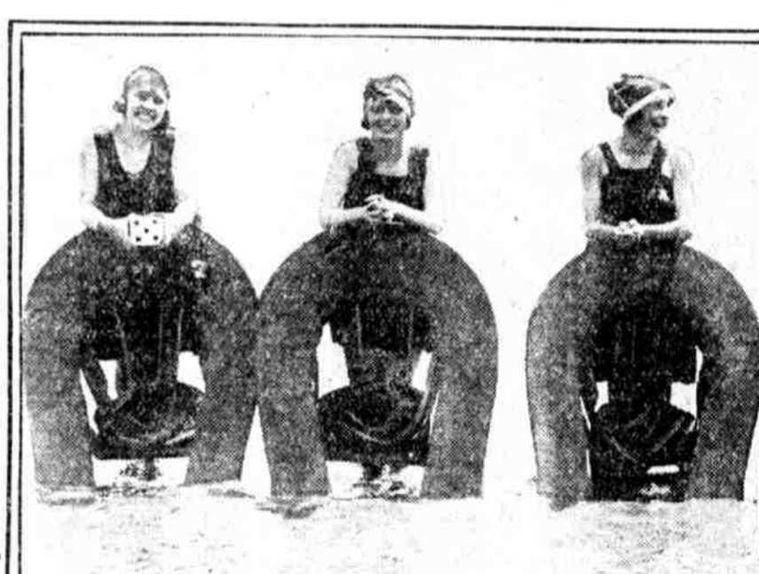
CHAIR FLOATS. This new mode of traveling through the waters of ocean, lake or river has proved very attractive to the 1921 bathers. The chairs are non-sinkable.