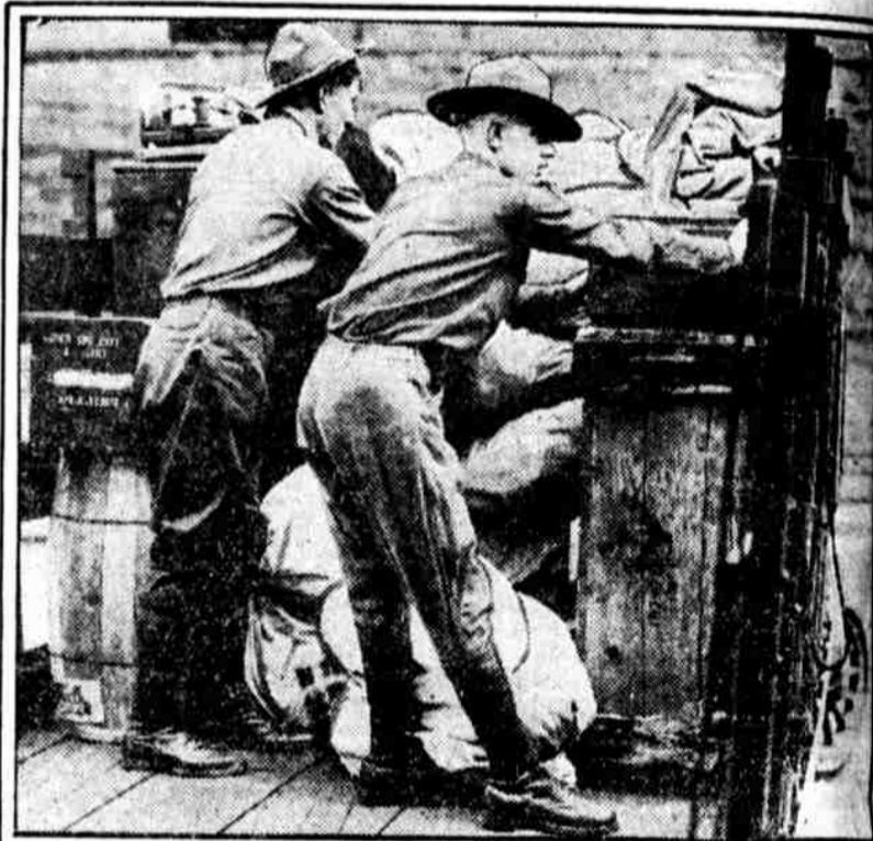
LOADING FOR MOUNT GREYNA. Two members of the 103d Engineers transferring regimental equipment from the trucks into a garage car at Broad and Callowhill streets.