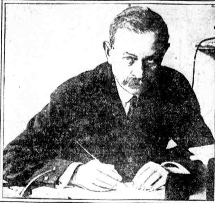
LORD BYNG. He sailed on Thursday from Liverpool for Canada, where he will succeed the Duke of Devonshire as Governor General of Canada. Lord Byng commanded Canadian troops during the war.