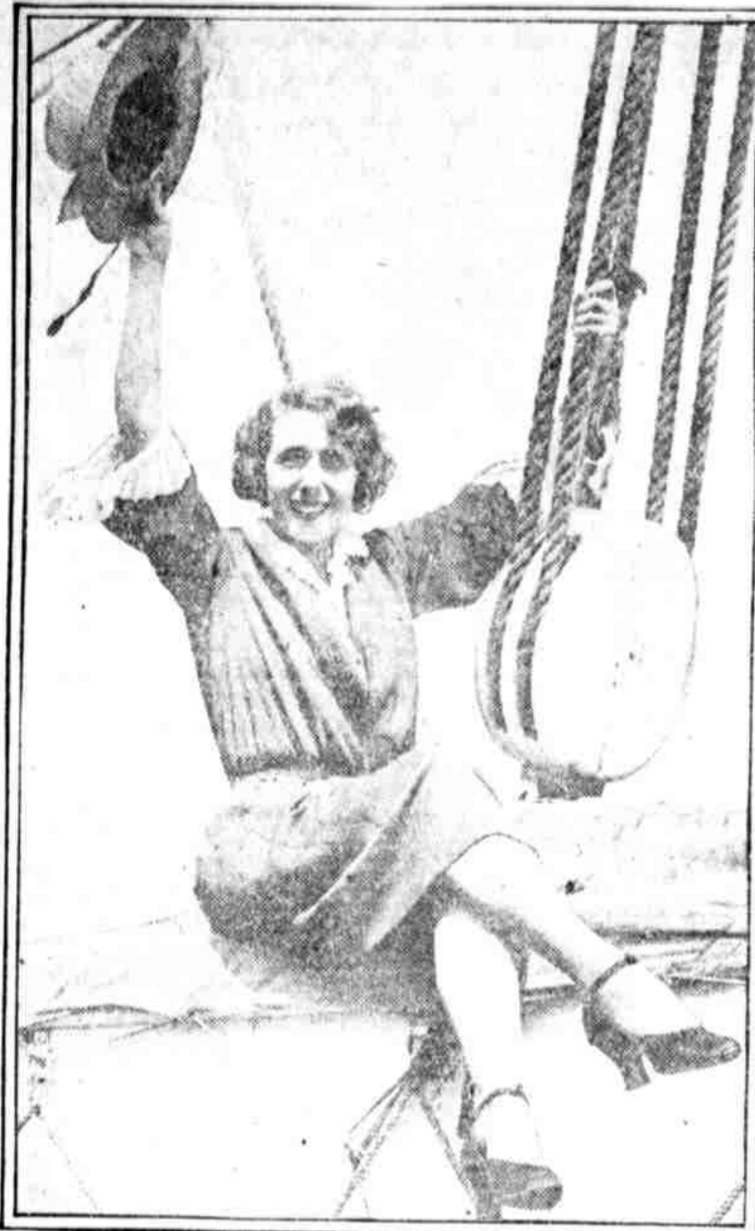
SHE'LL BE BACK. Mlle. Mistinguett, the French actress, waving good-by to friends as the S. S. La France sails out of New York for France. She said she'd come back again.