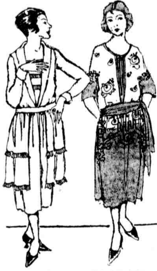
Jap Silk, $6.75 Tricolette, $6.75 —Gimbels, "Subway Store Day"

Practical gingham and chambrays for August and early Fall school wear. Pockets and stylish collars and short sleeves and belts and sashes. 85c. Ruffled Organdies for afternoon and Sunday best—pink, blue, maize and white. Sizes 6 to 14 yr.