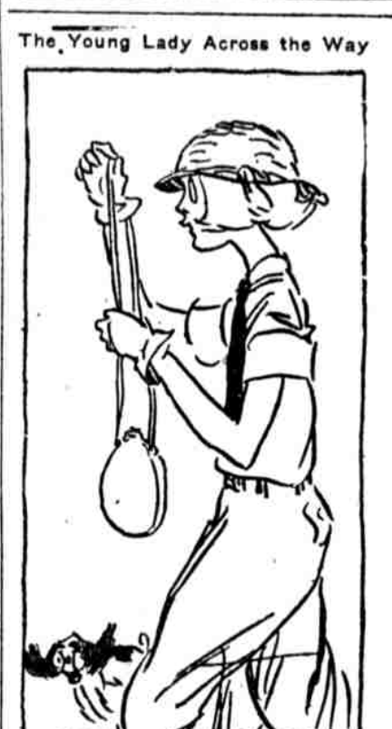
The young lady across the way says what she can't understand is how a baseball player can have a batting average of .500 in one game, as she shouldn't think there'd be time to pile up such a big one.