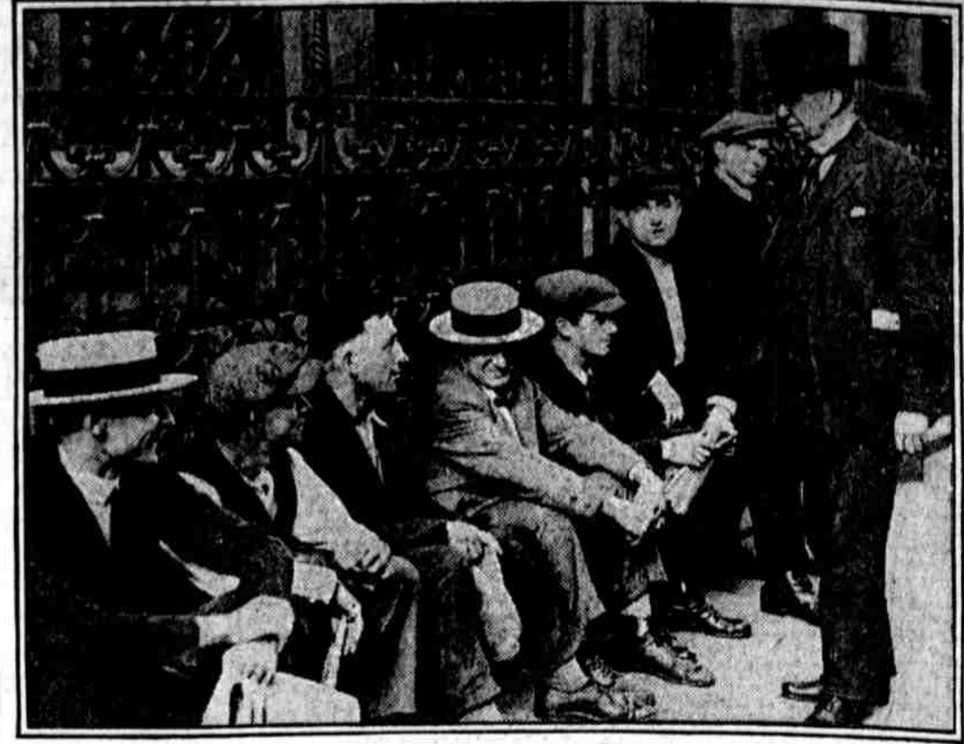
ANOTHER COXEY'S ARMY—MAYBE. General Jacob S. Coxe interviewing unemployed men in front of the New York State Employment Bureau. He is planning another historic march on Washington similar to the famous pilgrimage of March, 1894.