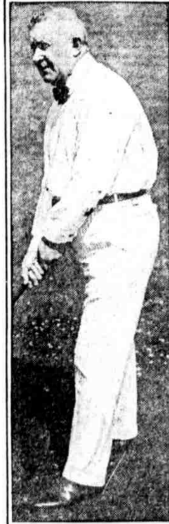
CHAS. MURPHY, Tammany Hall leader, on golf course, Southampton, L. I.