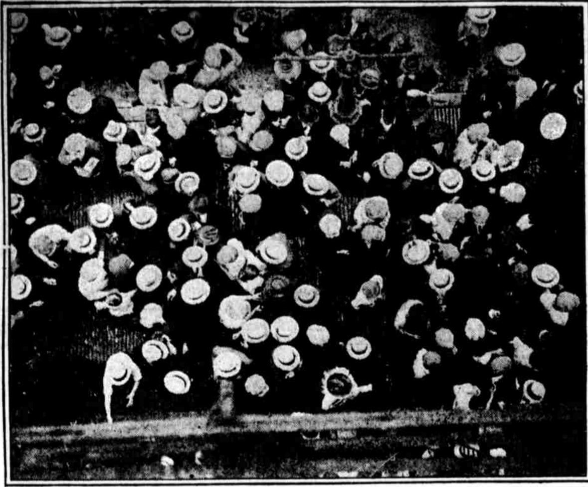
AS THEY LOOK FROM ABOVE. The camera caught this group of men and boys as they watched the baseball scores and read other news bulletins on the boards in the Chestnut street windows of the PUBLIC LEDGER Building at Sixth and Chestnut streets.