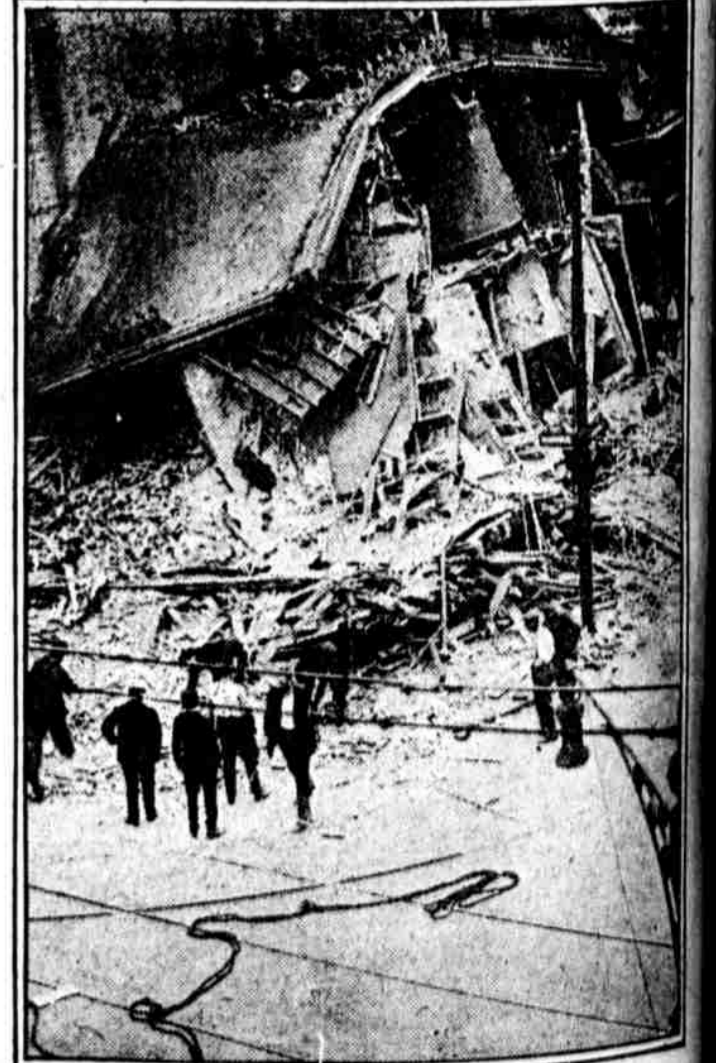
BUILDING COLLAPSES. The wreckage of an eighty-year-old saloon building at Washington and Johnson streets, Brooklyn, that has come to grief.