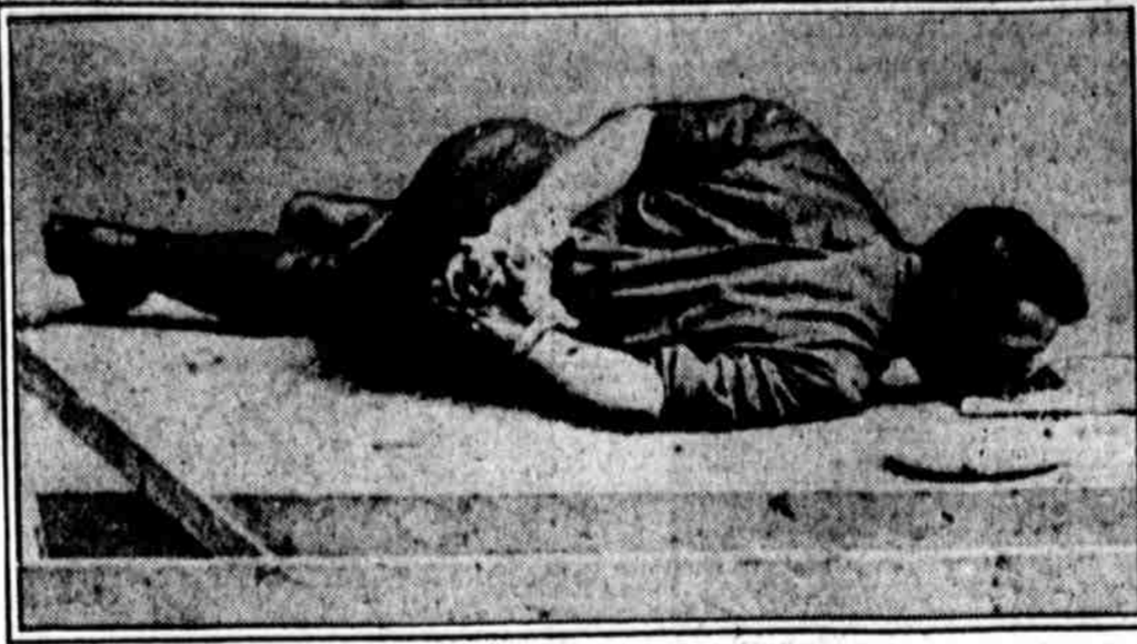
WHAT'S HE DOING? A sergeant connected with the United States forces at Coblenz, Germany, is working hard in a pie-eating contest as he takes part in the Fourth of July celebration along the Rhine.