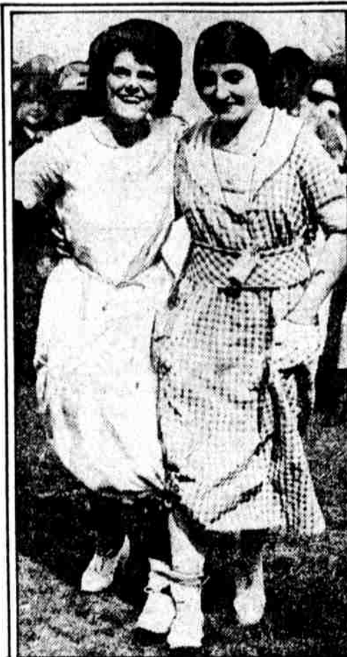
NO PRESCRIPTION NEEDED. Members of the Philadelphia Association of Retail Druggists, their families and friends got a day chock full of fun, without a doctor's advice, at their annual basket picnic held at Strawberry Mansion yesterday.