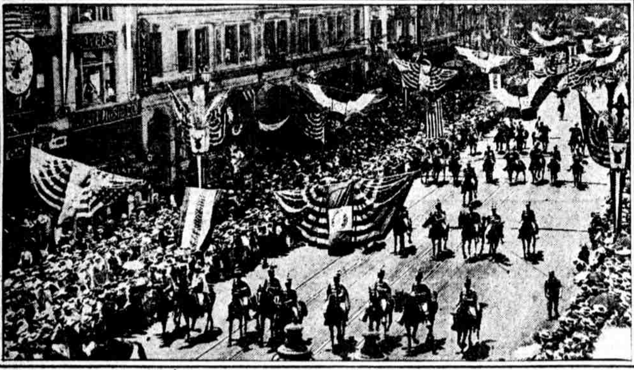
PHILADELPHIANS IN PARADE. The photograph shows the mounted division of the delegation of Elks from this city who took part in the annual parade of Elks at Los Angeles, Calif. It was part of the program of those attending the national convention of that organization.