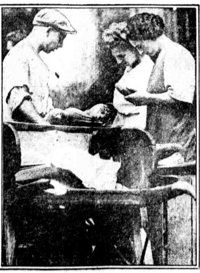
BUYING CUCUMBERS. Two customers making a deal with one of hundreds of pushcart proprietors found doing business on streets of South Philadelphia.