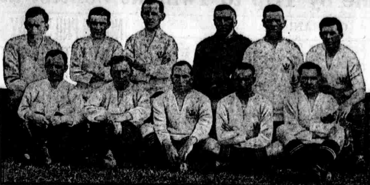
The Third Lanark team, which will play the Philadelphia Professionals tomorrow at Diston Field, Tacony.